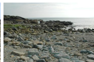
The southerly side of the beach