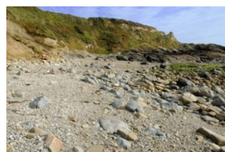
Looking towards the slipway

It is a dog friendly beach. There are no facilities at all, the nearest being at Perranuthnoe about 800m along the Coast Path in a northerly direction.