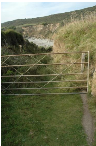
The gate down to the beach

TR20 9PF - 2kms east of Marazion at Rosudgeon on the A394 Penzance to Helston road, the road to Trevean is signposted. Follow the road for 750m where it ends at Trevean Farm. There are a small number of roadside places to park but be careful not to obstruct the road or farm gates. The footpath to the beach goes in a westerly direction around the farm and then joins the old 'green lane' (public footpath) where it links up with the Coast Path after 500m. After a short distance going in a southerly direction access to the beach is through a gate and down what was once a slipway but is now somewhat overgrown but nevertheless not difficult.