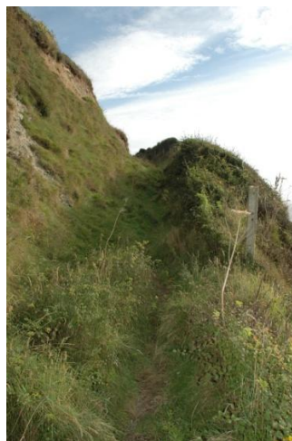
The old slipway