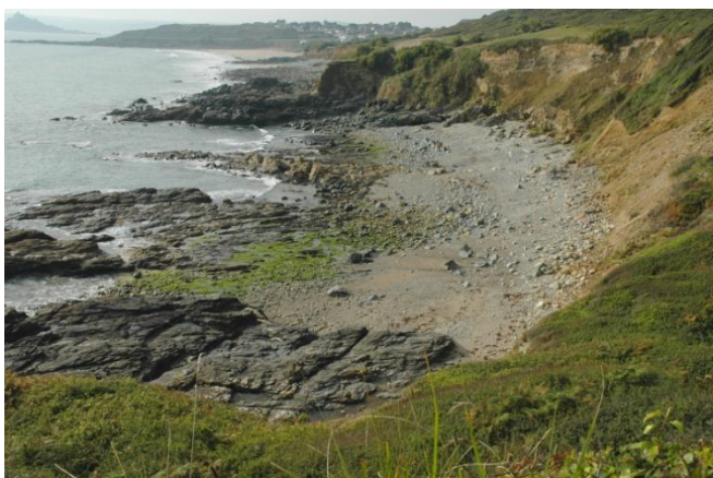
View of the beach looking north with Perranuthnoe in the distance

At one time fishing was at the centre of this small westerly facing cove, but sadly no more, although there is still evidence of past activities with the current access to the beach.