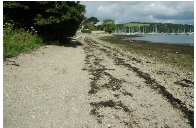
Mylor Beach past the Sailing Club with the Harbour beyond

the path to the Sailing Club and the lengthy beach.