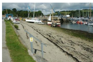
Part of Mylor Beach