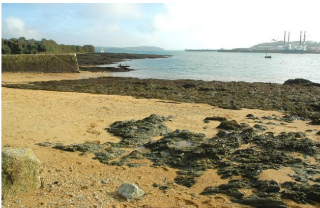
Trefusis Beach looking towards Falmouth Docks at low water

Trefusis Beach, or often known locally as Flushing Beach or Kiln Quay Beach, sits on the Fal Estuary immediately opposite Falmouth Docks; it is easily accessible and can be very sheltered with little or no swell. Mylor Beach is to the north along the foreshore around Trefusis and Pencarrow Points. Much of the foreshore in between is accessible from the public footpath that joins both beaches.