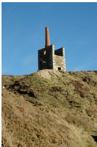
Engine House above the beach