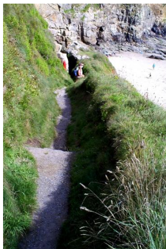
Steep and narrow access path