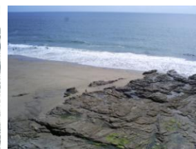
Flat rock platforms