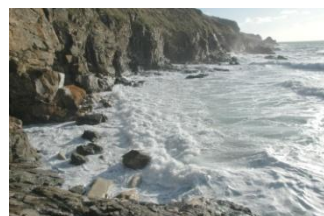
High tide in winter storm

In quiet conditions in summer snorkelling can be really good off the rocks on either side of the beach. The many rock pools provide much of interest, especially to children.