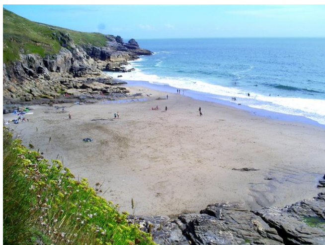
A fine sandy beach at low water

A westerly facing beach backed by dramatic cliffs and sitting beneath the prominent former engine house of the disused mine known as Wheal Proper. It is owned by the National Trust.