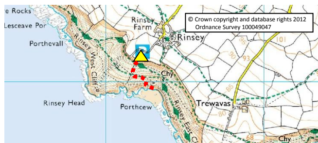
Location - Part of OS Explorer Map 102

Dogs are not permitted from Easter until October. There are no facilities, the nearest being at Ashton and Praa Sands (4.5kms).