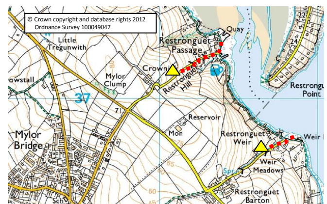
Location - Part of OS Explorer Map 105

The owners of Weir Beach request that dogs are kept on leads from Easter to September. There is the pub at Restronguet but no other facilities the nearest being at Mylor Bridge.