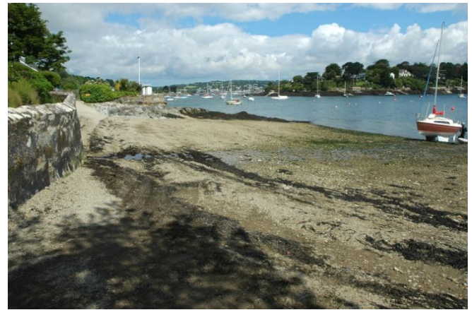
Weir Beach looking towards Restronguet Point

two beaches if parking at either presents a problem.