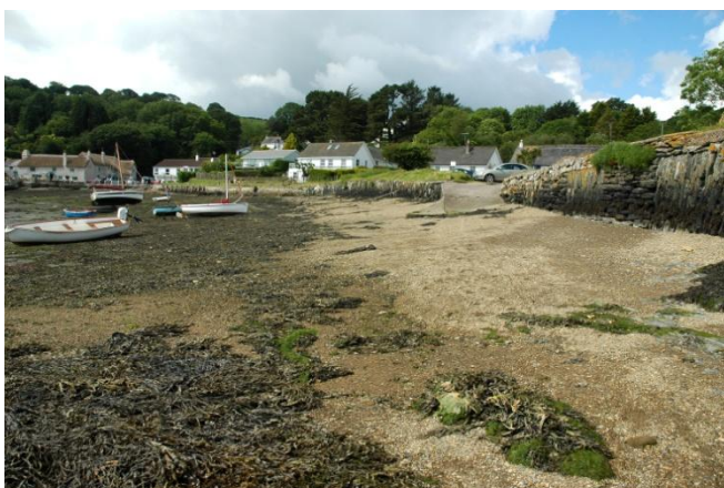
Restronguet Passage at low water

Whilst much of the foreshore is accessible along the western side of the Fal Estuary these two beaches are worth a mention. They are usually associated with the boating activities but these easterly facing sheltered locations can be good spots to sit and watch the world go by and Restronguet (or Restronguet Passage) has the added advantage being next to a well known and popular pub especially by those on the water.