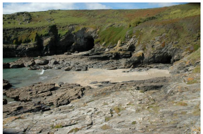
Piskies Cove with caves at low water

For all three coves take the vehicular track at the side of the car park. After 280m the track forks; go right for Bessy's Cove and Piskies Cove. After 100m at a point immediately above the small harbour there is a path on the left with steps down to the Bessy's Cove. For Piskies Cove continue along the path (which is the Coast Path) and past the remains of the fishermen's shacks (100m) and then after a further 150m there is a path on the seaward side of the Coast path with leads down over the rocks to Piskies Cove.