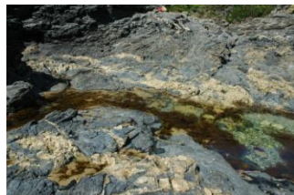
Wonderful rock pools