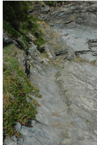
Path down to Bessy's Cove