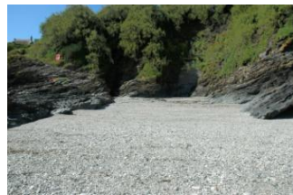
'The Harbour Inlet' on the right The shingle beach at Bessy's

who often line up along Battery Point seeking mackerel, pollack, and wrasse.