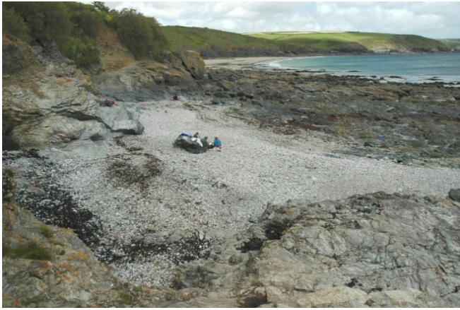
Coule's Cove – a shingle beach with Kennack Sands beyond