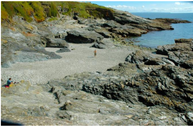
Bessy's Cove at low water

Four enigmatic small coves that are called Prussia Cove that derived its name from an 18 th Century smuggler called John Carter. He was known as the 'King of Prussia' due to his admiration with King Frederick the Great, of Prussia. He was a notorious character, part fisherman and part wrecker and smuggler operating from Bessy's Cove which even today still holds the romance of its infamous history.