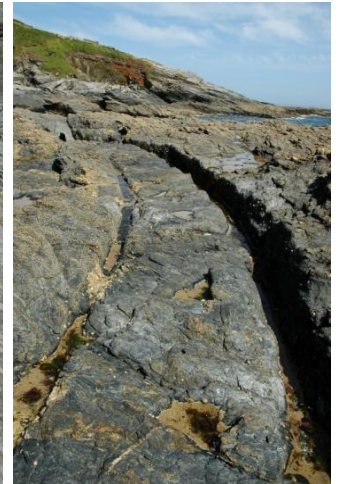
Track carved out of the rocks