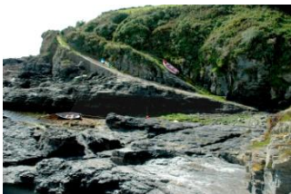
Slipway at Bessy's Cove

Piskies Cove is the furthest west and is in the lea of Cudden Point. It has a sandy beach and interesting caves. Bessy's Cove is the main beach which is shingle and has a small harbour and slipway and is still used by local fishermen. King's Cove is east of Bessy's but is private and there is no public access to it although it is the smallest of the coves. Coule's Cove, the most easterly cove, joins up with the beach at Kennack Sands . The Coves were originally known as Porth Leah and are now owned and managed by the Tunstall – Behrens Family who founded the International Musicians Seminar in 1972 at the Edwardian buildings rising out of the rocky headland above King's Cove and Coule's Cove. It is believed that Bessy's Cove was named after a local innkeeper who dealt in smuggled brandy.