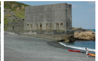
Views of a working fishing beach with quarrying history