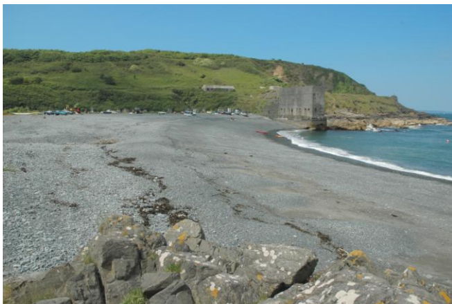
A shingle beach at low water looking towards Batty's Point

An easterly facing shingle beach that is surrounded by the evidence of former intense quarrying activities and is now more associated with the local fishing industry. It is very accessible and popular with divers as it is the nearest public beach (with parking and the ability to launch craft) to the Manacles reef. It is known locally as Pro'stock.