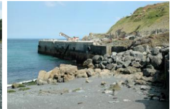
The Jetty and Quarry

otherwise, it is a good beach for swimming at high or half tide, helped by the gently shelving beach profile.