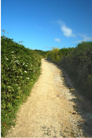
Path from the car park

When the conditions are right they can be wonderful beaches for swimming especially on an incoming high tide when the steeply shelving beach makes entry into the water ideal. However, there are times on an ebbing tide at low water when currents can make it unsafe. When there is a swell it is