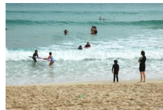
Waves and games

There is a beach cafe/restaurant that also sells beach items. The pub is located opposite the car park. There is also a cafe at the Minack Theatre which is open during the summer and the Telegraph Museum which has limited opening in the winter but open daily in the summer.