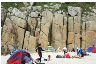
Sculptured granite rock faces