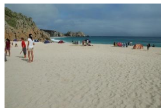
Views of the main beach

The triangular shaped main beach is made up of coarse shell based white sand that seems almost exotic when the sun reflects off the granite cliffs and rocks. It shelves quite steeply and flattens out at low water. There is always an area of sand above high water mark. As the tide recedes it is possible to walk round the Point to Percella Cove which is similar to the main beach but care needs to be taken not to get cut off by the tide as there is often little or no beach at high water; It is much quieter than the main beach which can be crowded in summer. Both beaches can be very sheltered from all but winds from the south.