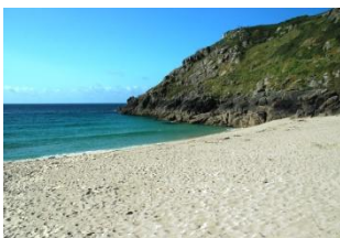
Early on a summer morning

TR19 6JX From Penzance take the A30 road to Land's End and after 3.5kms take the B3283 through St.Buryan and after a further 4.5kms the road to Porthcurno is signposted on the left. Follow the road down the valley and a large car park (capacity over 300 cars) is on the left. In summer there are