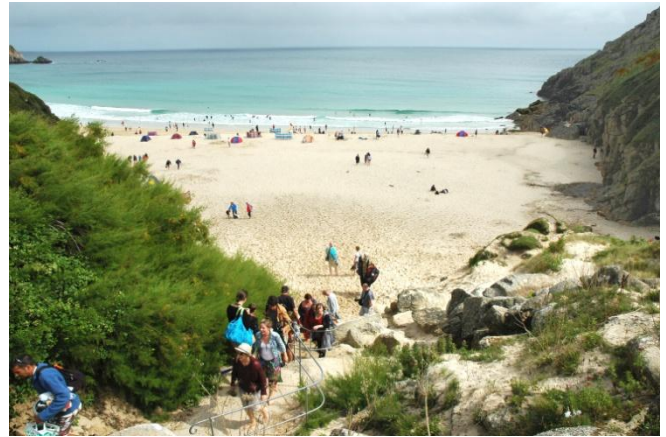
The access point on to the main beach

restrictions on roadside parking and often the road can get congested with the large number of visitors during the day to the Minack Theatre.