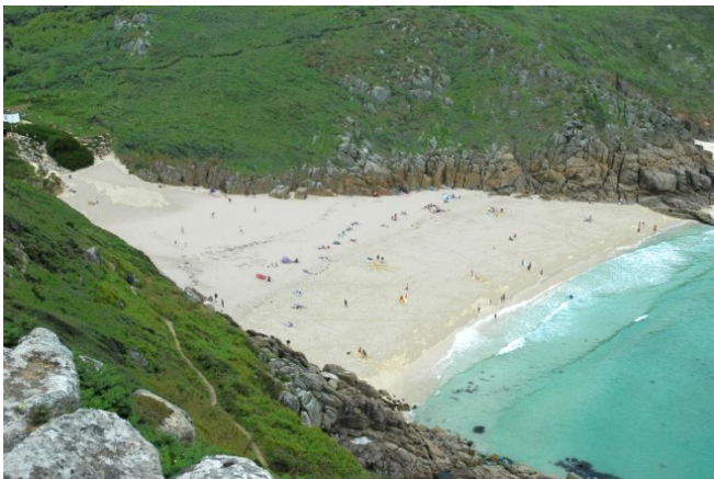
Porthcurno Beach from the cliffs below the Minack Theatre

These are popular fairly small south facing beaches with glorious white sand and surrounded by enigmatic granite cliffs. Porthcurno is the main and most well known beach but to the east around Percella Point is an equally delightful but smaller beach called Percella Cove that is only accessible from the main beach at low water. Porthcurno is the home of the famous Minack Open Air Theatre which is perched on the cliff-top overlooking the Cove and with stunning views along the coast to Pednavounder Beach and the headland of Logan Rock. Porthcurno was once the home of 'Cable and Wireless' and in the 19 th Century