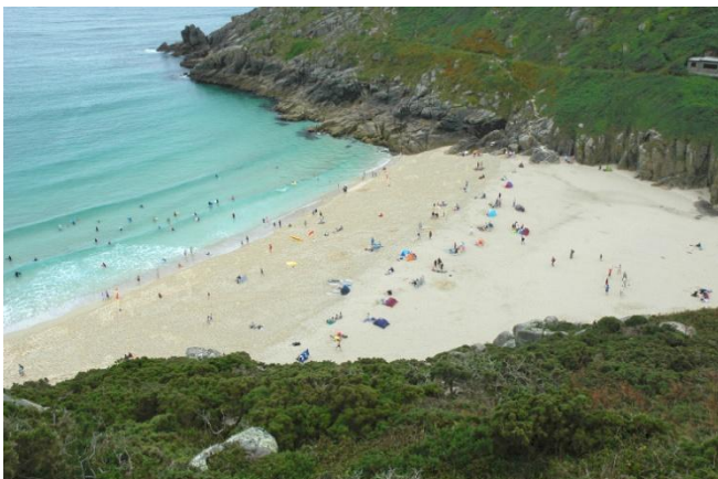
Porthcurno Beach looking out to Minack Point

On higher tides there is interesting snorkelling out to Minack Point but generally they are not snorkelling beaches. There are very few rock pools and occasionally some sandy pools but they are not a