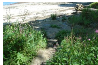
Access to Padgagarrack Cove