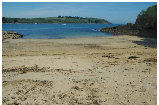
Bosahan Cove looking across the Estuary to Porth Saxon

The nearest toilets are is the Helford Car Park. However, if having paid to enter Bosahan then there are toilets and other facilities which are available.