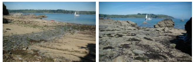
Views of Ponsence Cove at low water

From the car park at Helford walk along the public footpath past the Sailing Club across the road and past Treath Beach ; continue along the Coast Path,