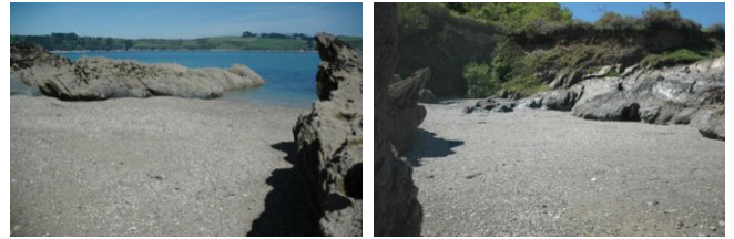
An unnamed shingle Cove adjacent to Ponsence Cove

Grylls family in the 19 th Century and it has been described as 'the most Cornish of all Gardens'.