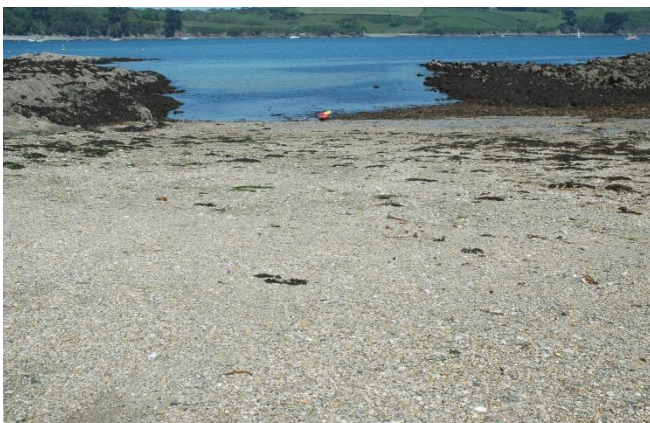
Padgagarrack Cove at low water

There is some excellent snorkelling along this stretch of the Estuary especially east of Ponsence