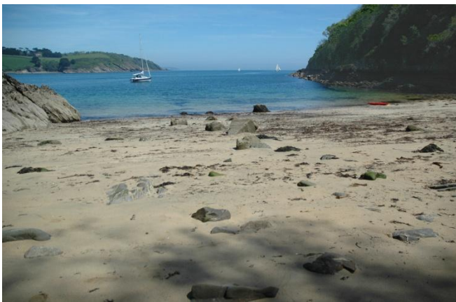
Ponsence Cove looking out to the mouth of the Estuary

These three delightful coves on the southern side of the Helford Estuary are unlike any other beaches in Cornwall as they face north, but are incredibly sheltered and backed by mature woodland that runs down to the foreshore. On a summer's day they can appear quite magical and often with no one on them. They are easily accessible yet mostly visited by boat.