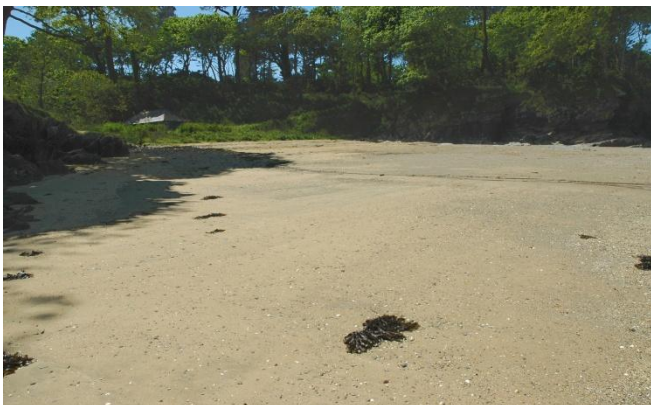
Bosahan Cove – a sandy cove backed by trees and woodland

All the Coves can be accessed along the Coast Path either from Helford or St. Anthony . Ponsence, (also called Porsenna), is the most easterly of the Coves with Bosahan in the middle and the smaller Padgagarrack Cove to the west nearer Helford. In addition there are a couple of small unnamed coves immediately west of Ponsence Cove and also one west of Padgagarrack all of which are accessible from the Coast Path. All the Coves and foreshore are part of the Bosahan Estate which includes the little known, but wonderfully exotic sub-tropical gardens, and is just one of a number of gardens which are a trademark of the Estuary. The House was built by the