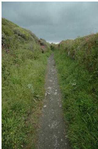
Access path along the valley