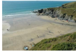
The beach and Polbreem Point