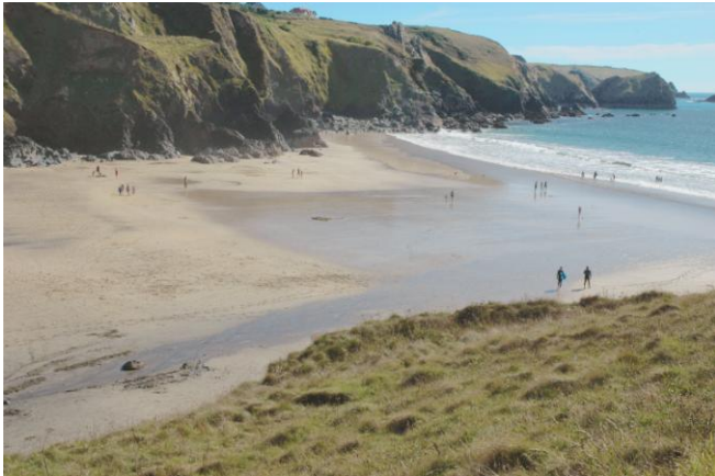
At low water looking towards Henscath Point

This westerly facing beach has a fine expanse of sand at low water. It is unusual as it is close to the village of Mullion but there is no recognised parking area for the beach. Much of the beach is backed by high cliffs.