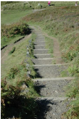
Steps on the Coast Path

Mullion is on the B3298 off the main road from Helston to the Lizard. There are number of possible places to park for the beach. The main village car park - TR12 7RJ - is some 3km away. It is recommended that roadside parking is used in either of 2 locations. The first is along the road out of Mullion towards Poldhu . TR127HZ -1kms from the village centre there is a public footpath sign to the Cove; the walk is almost 2km and once clear of the housing is very straightforward. The other route is to take the road to Mullion Cove from the village - TR12 7EN - and after 1.5kms turn right into Polurrian Road and park where permitted. By the entrance to the