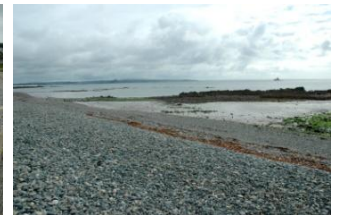
Lariggan Rocks at Wherrytown