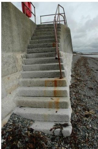
Steps from the Promenade

There is abundant roadside parking along the Promenade and a car park at Wherrytown (capacity 70 cars). Alternatively being so close to the Town Centre there are a number of car parks within a short walk. There are a number of flights of steps on to the beach along the Promenade but beyond Wherrytown at Newlyn Green access is on a level. Access to the beach is straightforward and in places easy for the less mobile although walking across the stones above high water is not easy.