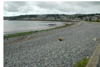
Stony beach towards Newlyn

Dogs are not permitted from Jubilee Pool along the Promenade to Wherrytown. From the Lariggan Stream which crosses the beach along to Newlyn, dogs are allowed.