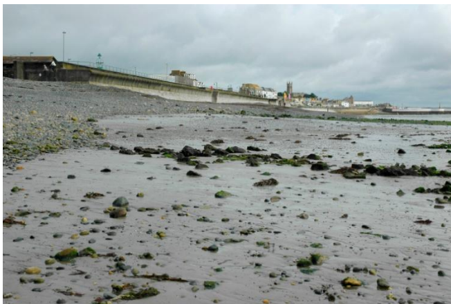
The Promenade looking towards Jubilee Pool at low water

This is the closest beach to the centre of Penzance (about 600m). It is essentially one beach that stretches from Newlyn to the Jubilee Swimming Pool at Battery Rocks. By Cornish standards it is perhaps not the most attractive of beaches because of the grey shingle and fine silt exposed at low water.