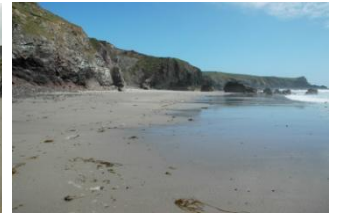
Flat sandy beach at low water