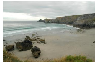
Looking towards Kynance Cove