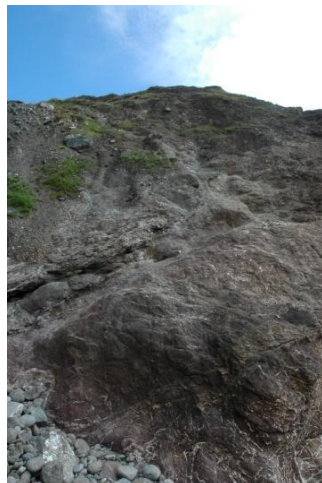
Access down Holestrow Cliffs