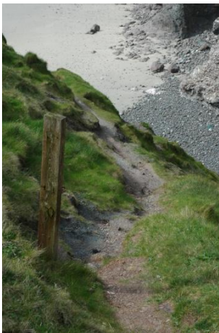
Dangerous cliff access

TR12 7PJ - Access is along the 'toll road' to Kynance Cove from the A3083 Helston road to Lizard Village and is well signposted. 1km along the 'toll road' on the left-hand side is a track at a property called 'Holestrow' which leads to a small parking area (capacity about 15 cars). A path leads to the Coast Path and on the Holestrow Cliff is a narrow, steep path which leads to the beach – the section just above the beach is especially difficult and care needs to be taken. There is an alternative at the other end of the beach which can be accessed from the Coast Path but due to Cliff falls it is quite dangerous for those not used to negotiating the descent. It is not suitable for families, the young and elderly.