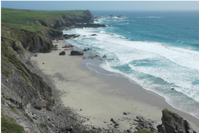
View from Holestrow Cliffs at low water

A striking westerly facing large sandy beach that is difficult to access and as a result is little used but a favourite for many local surfers. It is only 550m from Kynance Cove but is a stark contrast in every respect.