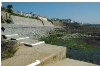
Stony beach at Marazion

The main beach which faces south west is a continuation of Long Rock Beach sweeping past the sand dunes of Marazion Green, then the town itself, and Top Town Beach (sometimes called Pig Cove). At high tide St. Michael's Mount is an island but at low water it is joined to the mainland by a wonderful granite stoned causeway over 360m in length and was once the route taken by pilgrims visiting the buildings at the top of the Mount which between the 8 th and 11 th Centuries was a Monastery; the Mount is now owned by the National Trust but continues to be the official residence of Lord St. Levan. The Mount was originally called Karrek Loesy'n Koes meaning 'grey rock in the woods'. There is a sandy beach within the Harbour on the Mount. Geologically it is interesting as it is a 'granite outlier' from the distinctive granite intrusions of West Cornwall. There are ferries from Marazion to the Mount when the tide is high.