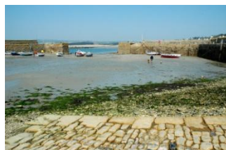
Sandy beach in Mount Harbour