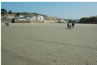
Beach below the town

The westerly end of Marazion Beach, as it joins up with Long Rock, tends to be a mixture of sand and shingle above high water but a fine flat sandy beach at low water. Below the town in the vicinity of the causeway and Chapel Rock there is little or no beach at high water but a substantial area of sand at low water that stretches all the way to the Harbour on the Mount. The only sandy beach on the Mount is in and around the Harbour. The Top Town Beach is separated from the main beach by a small jetty and harbour and an area of rocky foreshore at Top Tieb; it is a mixture of sand, shingle and stone above high water and sand at low water. The westerly end (adjoining Long Rock) of the beach can be quite exposed but in the lee of the Mount it is usually more sheltered. Marazion Beach is often much underrated and is very good for families as there is a well appointed play area next to the main car park.