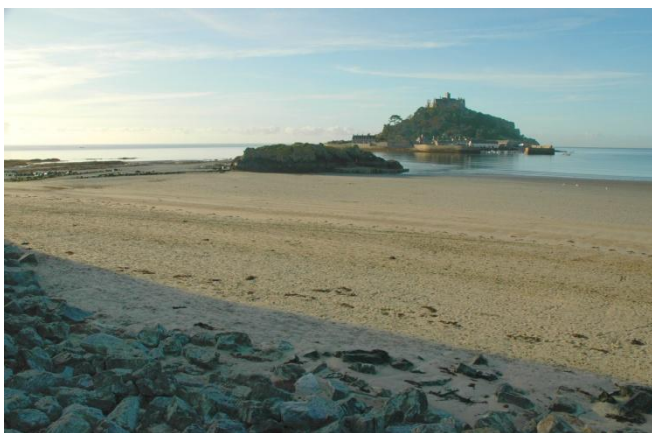
Marazion Beach with the enigmatic St. Michael's Mount beyond

The beach at Marazion is dominated by the distinctive feature of St. Michael's Mount which frames Mount's Bay, reputed to be one of the top ten most beautiful bays in the world. Marazion itself is the oldest chartered Town in Britain and was known by the Romans as Ictis or 'tin port'. Its name is derived from the Cornish 'Margasynow' meaning Thursday Market.