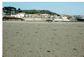
Sandy Marazion Beach

TR17 0EQ or TR17 0EG On the A30 at the Long Rock roundabout 2kms east of Penzance take the road through Long Rock itself and continue past the car park on the right next to Long Rock Beach and after 1km there is a car park on the left (capacity 120cars) next to Marazion Bridge over the Red River. The main car park for the beach, Marazion itself and The Mount is a further 300m on the right (capacity 370 cars+). A smaller car park (capacity about 100 cars) is a further 280m nearer the town on the right. Coming from Helston direction on the A394 at the junction with the A30 take the road signposted to Marazion and the car parks are as described above. Similarly from Hayle on the A30 at the roundabout junction with the A394 follow the signs to Marazion. There is only very limited roadside parking in Marazion.