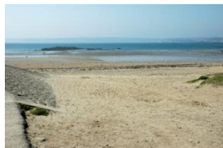
Beach next to the main car park