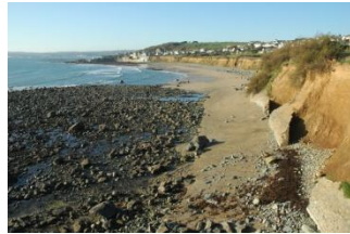
Top Town Beach