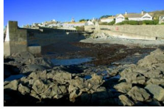
The Harbour at Top Tieb

Square and Market Place in the centre of the Town down to the main beach and the causeway.