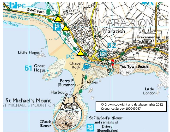
Location – Part of OS Explorer Map 102

Dogs are not allowed on the main beach from the beginning of May until the end of September from 8.00hrs to 19.00hrs. However, there are no restrictions on Top Town Beach. There are toilets next to the playground (behind the dinghy park) and off the Square in the middle of Town. There are a range of shops, cafes, pubs and restaurants close to the beaches in the Town. There are slipways next to the Town and main car parks for launching craft but the launching of Jetskis is prohibited.