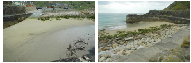
Views of the Harbour and beach