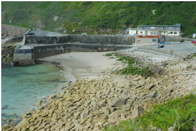
Looking down over the harbour and small beach at low water