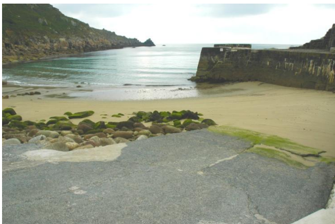
The sandy harbour at low water

TR19 6XH - From Penzance go to Newlyn and then take the B3315; after 4.8kms at the bottom of a valley turn left and follow the road for 1.5kms which ends up by the Harbour and a small car park (capacity about 34 cars); there is also parking above the quay. Access on to the sandy part of the beach within the Harbour is down the slipway (suitable for pushchairs/wheelchairs) from the car park.