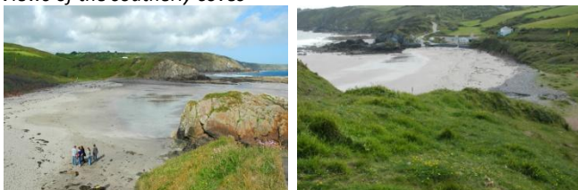
Views of the main beach