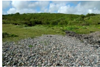
Valley above the main beach

gently sloping beach leading to a flat expanse of sand at low water. The southerly beaches usually have sand above the high water mark but quite often there are areas of shingle below which gives way to sand at low water. Both the main beach and the east beach have areas of stones where the streams from the valleys cross the beaches. At the main beach it is possible to walk up across the stones on to grassy areas and a natural pond at the base of the valley. The southerly beaches tend to be more sheltered than the others but at high tide they are cut off from the main beach access and getting off the beach involves a scramble on a route up the cliffs to the road. At low tide it is possible to walk on the sand from the main beach to the east beach but at high tide it involves using the paths across the Towans. East beach still has the remains of war time fortifications above the beach which are somewhat unsightly.