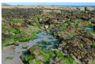
Rock pools abound