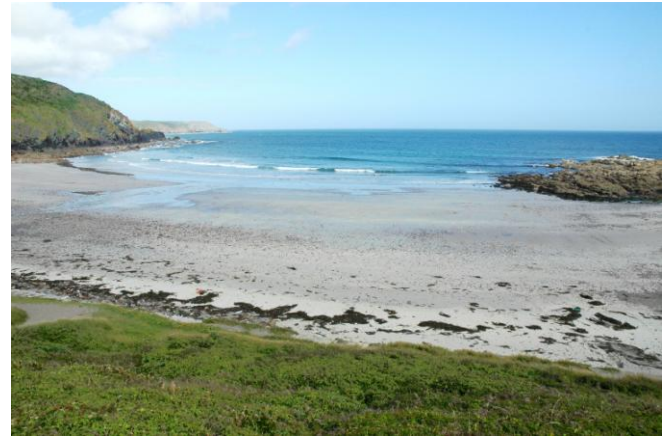
The easterly beach at low water

beaches have exposed the geology to startling effect. The beaches have an array of serpentine and other pebbles found nowhere else in the UK. The Gwendreath Valley part of the Nature Reserve has a special flora as well as the geological importance of the former Gwendreath Serpentine Quarry.