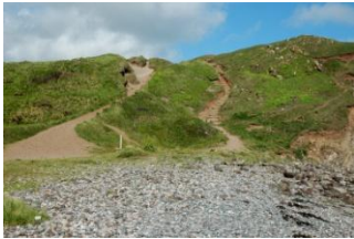
Paths to the east beach