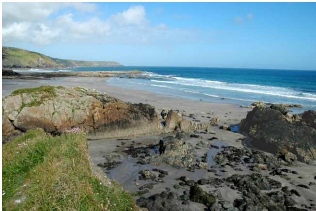
The main beach at low water with Black Head in the distance

One of the largest beaches on the Lizard peninsular, Kennack Sands is a popular family beach that is also well known for its geology, rock pools and wonderful conditions for snorkelling. 'The Sands' consist of a number of beaches that connect each other at low tide. The main beach next to the car park and cafes is the most popular, mainly because of its easy access. The easterly beach (known locally as 'Dog Beach') is separated from the main beach by Kennack Towans and the rocky outcrop, the CaerVERRACKS. To the south of the main beach around a rocky area there are a series of small coves.