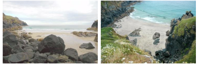
Views of the beach

The cove is a classic Cornish 'inlet' beach with a fairly large expanse of good sand that somehow belies