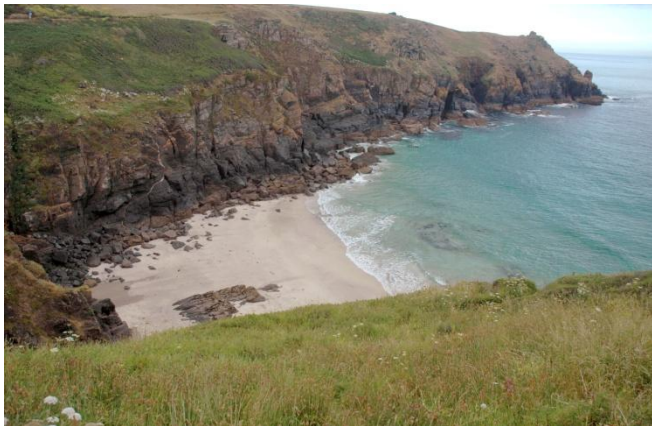
View of the Bay looking towards Pen Olver Point

It is a cove with a fine sandy beach at low water but there is no beach at high water. Surrounded by high cliffs it is surprisingly sheltered given its location.