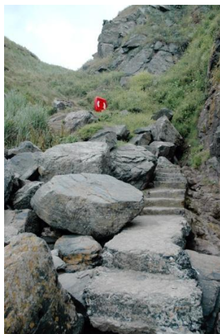
The path and steps to the beach