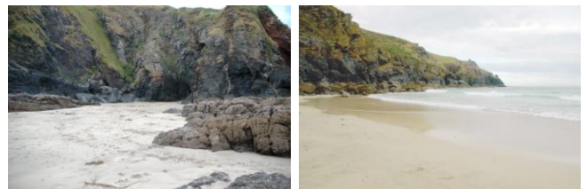
A fine smooth sandy beach at low water

Dogs are permitted but there are no facilities; the nearest toilets are at the NT car park and Lizard village. There are refreshment facilities at Lizard Point and the village centre.