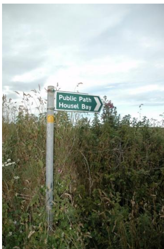
Sign from the road to the Point

There are 2 ways to get to House Bay each having its merits. The first is to park in the centre of Lizard village (capacity over 160 cars) – TR12 7NZ - and walk towards Lizard Point; after 500m there is a track and public footpath marked House Bay (a further 500m). The second way is to park in the National Trust car park (capacity over 120 cars) – TR12 7NU -above the Point and head for the Coast Path below the lighthouse; once on the Coast Path head east for approx. 750m and the steep path and steps to the beach is self apparent.