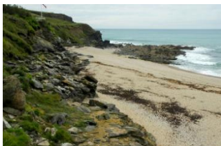
The southerly end of the beach

TR12 7QB - From the A3083 at the southerly end of the Cudrose Airbase 3.7kms from Helston there is a road signposted to Gunwalloe. 250m beyond the hamlet turn right and after a further 250m there is a small parking area (capacity about 15 cars) close to the slipway to the beach. If the parking area is full be careful not to obstruct the road and adjacent farm. Access on to the beach is easy and suitable for the less mobile.