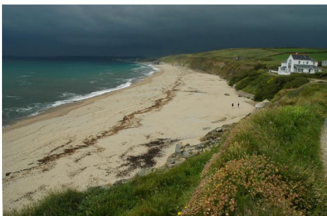
The fine stretch of shingle beach with atmospheric storm clouds

This is the southerly end of the 4kms stretch of beach from Porthleven . Facing south west it receives the full force of the Atlantic swell and all winds from a westerly and northerly direction. A very treacherous beach for bathing it often lives up to its name meaning 'Cliffs of Hell' in Cornish. It is not to be confused with Gunwalloe Church Cove, 1.5kms to the south.