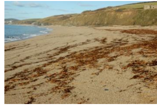
Looking north towards Loe Bar

The steeply shelving shingle beach has a wide strip above high water mark. Because of the shelving there is not a vast expanse of beach exposed at low water. The shingle (pea gravel) is still used for building purposes and is taken from the beach as long as it is