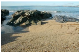
Banks of shingle