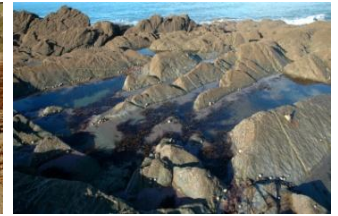
Rock formations and rock pools

dug by hand. The beach stretches for 2kms to the north where it becomes Loe Bar . It is an exposed beach and great for a walk but is not ideal for families. It is possible to scramble across the rocks around Baulk Head to Park Bean Cove (250m) and even to the sandy Halzephron Cove (480m) beyond although it is not recommended because foreshore climbing abilities are required and the tides must be suitable.