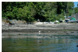
St. Antony Beach