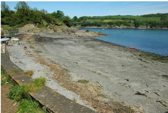
Flushing Cove and Gillan Creek at low water

These Coves and beaches are on either side of Gillan Creek on the southern side of the mouth of the Helford Estuary. Flushing, Gillan, Eastern and Coneysburrow Coves nestle into the southern side of the Creek whilst St. Antony Beach, just below the