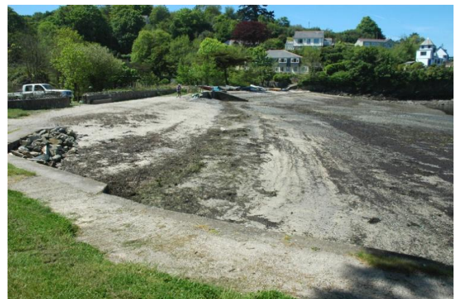
Gillan Cove – a mixture of sand and shingle

The beach at St. Antony is just below the car park and down the slipway. To get to the Coves across the Creek the coast path involves negotiating stepping stones which are located 400m along the narrow road beside the Creek; on the other side it is a 400m walk to Flushing Cove. However, approximately three hours either side of high water the stepping stones crossing Gillan Creek are submerged. When the stepping