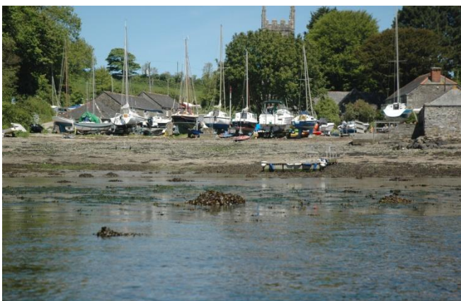
St. Anthony Beach below the Church

There is safety equipment at St. Anthony only. Swimming is best at Eastern and