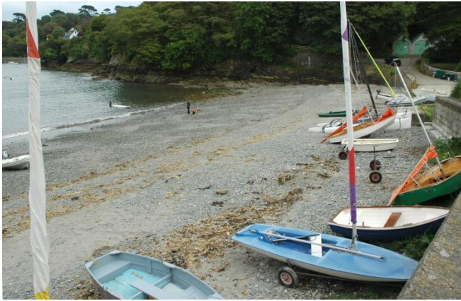
Flushing Cove with boats moored up on the beach in summer

with the water no deeper than 180mm at low water. The narrow neck of water leading towards the old gypsy caravans is the deepest and should be avoided. The stepping stones are usually covered in slippery green seaweed and are not used by locals. If the Creek crossing is used remember the window of opportunity with the tide is at best 3 hours and the alternative is a 3.5km walk around the Creek on the road via Carne. The path to Flushing Cove and on to Gillan and Eastern Coves is clear and straightforward (300m and 400m respectively); access to the Coves from the path is easy with a slipway at Flushing. Coneysburrow Cove can be reached by scrambling down the grassy cliff from the Coast just beyond Eastern Cove but is not too difficult.