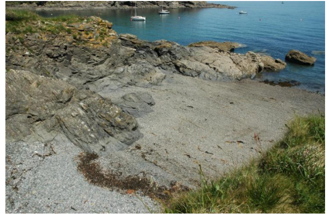
Eastern Cove and the mouth of Gillan Creek

the above directions to Manaccan and in the centre of the village there is a signpost to Gillan and St. Keverne; follow this road for 2.4kms past Carne to crossroads signposted to Flushing and Gillan and continue for 580m to the end of the road. Note that the road to Gillan on the right is private and only a public footpath.