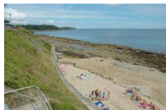
Tunnel & Gyllyngvase Beaches