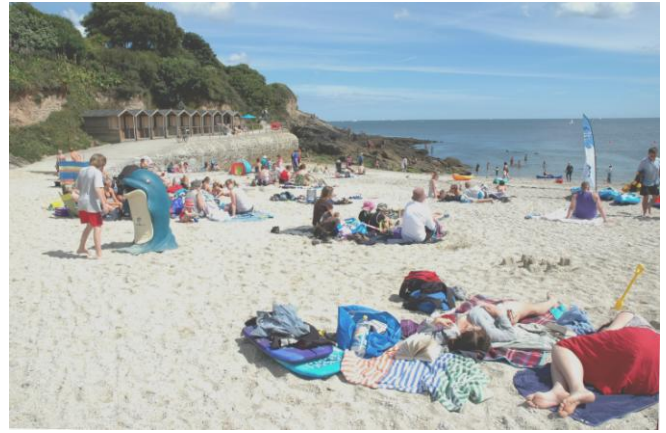
Swanpool in summer

Swanpool has a large car park (capacity over 300 cars) – TR11 4EJ – and is immediately next to the beach. Castle and Tunnel beaches do not have any dedicated parking except for a limited amount of roadside parking along Cliff Road. However there are a number of car parks that serve the Town which are within 600m of these beaches; Grove Place – TR11 4AU ; The Maritime Museum – TR11 4BS ; The Dell – TR113HP ; The Station – TR11 4LT .