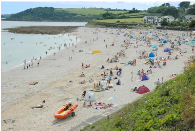
Gyllyngvase Beach looking west

Falmouth is most well known as the deep water port at the mouth of the wonderful Fal Estuary. However, it also has a series of south facing popular beaches. Whilst these do not have the same abundance of fine sand as the of the north coast resorts, they nevertheless have other attributes and are as a result popular with families. Gyllyngvase Beach is the largest and most popular. Swanpool , Castle and Tunnel Beaches are all close by and very accessible.