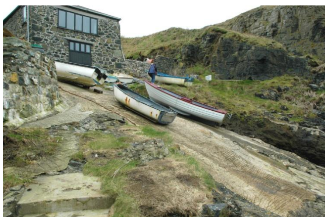
Slipway above the beach

There is no beach at high water but as the tide