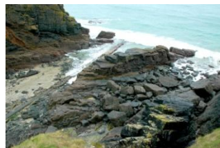
The mouth of the inlet

A small stony cove on the easterly side of the Lizard close to Lizard Village and should not be confused with Church Cove Gunwalloe which is on the westerly side of the Lizard, north of Mullion. The road down to the Cove past the delightful St. Winwalaus's Church and picturesque thatched cottages is better than the Cove itself which is dominated by an unsightly sewage pipe. Former fish cellars and boat houses above the Cove are now residential properties.