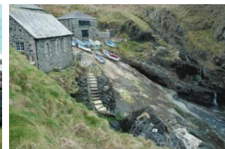
View from the cliff looking north

recedes a mostly stony beach appears which can have patches of yellow sand at times but this depends on the weather conditions. The tide goes out to the mouth of the inlet some 50m from the slipway. The inlet is only about 25m wide and is dominated by the serpentine cliffs either side which can make it appear very dark on occasions. A small amount of shell fishing is still undertaken from the Cove so that in summer there are usually a number of boats at the top of the slipway.