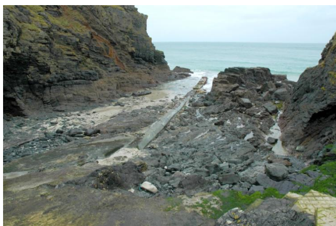
The easterly facing Cove at low water

It is possible to launch small craft from the slipway but any vehicles (and trailers) need to be parked in the car park. Sea water quality is unknown including the effects of the outfall. Also the quality of streams that cross the beach are unknown. A number of disused serpentine quarries in the valley serve as a reminder of a once thriving local industry.