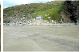
Chalets at Wiggle Cliff

500m to 1km where there are a number of small parking areas and 4 paths down to the Beach as shown on the map. All the paths are quite steep.