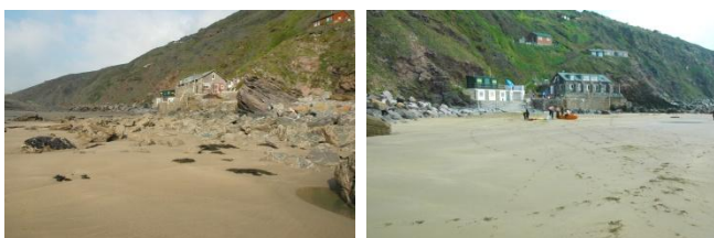
Views of Tregonhawke Beach at low water

PL10 1JS & PL10 1JH – For the main car parking areas at Tregonhawke. From the A374 Trerulefoot to Torpoint road, turn off on to the B3247 and continue to the viewing lay-by next to Tregantle Fort; just beyond is a right turn to the coast road; continue for 1.8kms past Sharrow and 400m beyond Freathy is a large seasonal car parking area (capacity over 300 cars) on the left; opposite is a lengthy path (480m) that winds down to Tregonhawke Beach. 1km further on from the above parking is another seasonal car park (capacity 300+ cars) next to the Whitsand Bay Holiday Park with various small roadside parking opportunities in between. The main path to Tregonhawke Beach is opposite past a cafe. For Wiggle Beach continue along the road – PL10 1JY - for