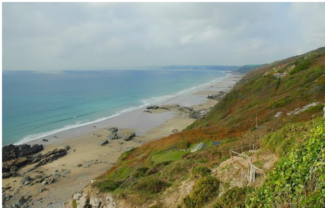
Wiggle Beach in the foreground with Tregonhawke beyond

This marvellous 2.5kms stretch of Whitsand Bay starts at Captain Blake’s Point north of Polhawn Cove all the way to Freathy . It is a favourite spot for those from Plymouth. At low water it is a superb sandy beach interspersed with small rocky areas. The southern end of Wiggle Beach has more rock outcrops. There are a maze of paths down to the beaches often past the many quirky chalets that are scattered along the cliffs.