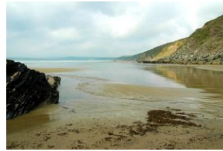
Wiggle Beach at low water