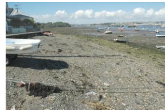
Stony Beach at Torpoint