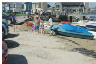
Imported sand at Saltash