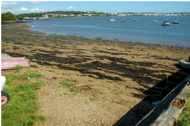
Wearde Quay Beach near Saltash at low water

The Tamar and Lynher Estuaries contain large amounts of accessible foreshore including some recognised beaches. Barn Pool and Cremyll near the mouth of the Tamar are dealt with separately but the rest cover a wide area. Although much of the