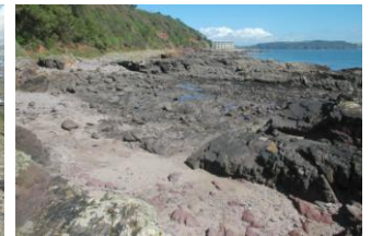
Hooe Lake Beach

covered in imported sand and is quite popular. Wearde Quay Beach is the most scenic with great views down the Estuary but has areas of weed so typical of Estuary beaches where there is little wave action. The Torpoint Beaches are fairly stony but very accessible. The strip of shingle beach at Lower Anderton on the southern side of Millbrook Lake is sheltered and secluded.