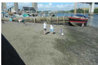
Shingle beach at Saltash

The shingle beaches might not be that special by Cornish standards but nevertheless provide important places to go and reach the water. On the northern side of Town Quay in Saltash the shingle is