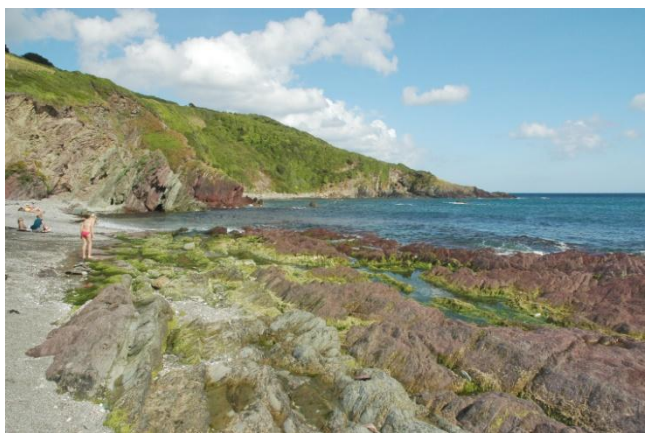
Rock pools on Rotterdam Beach with 'Stinkers' Beach beyond

PL13 2RY - There are two access roads from the A387 (the main road between Looe and Polperro) both of which are narrow with steep hills and sharp bends but end up very close to the beaches and car parking. The main parking area is next to Talland Beach and the Beach Shop and Cafe but is relatively small (capacity 60 cars) but is extended into the field beyond at peak times: it is closed from October until Easter (turning around is difficult). There is a small area that is used for parking (about 12 cars) above Rotterdam Beach and roadside parking between the