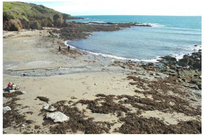
Talland Sand at low water

Although only a short distance from both Polperro and Looe, Talland Bay is delightfully secluded. It has two main beaches, Talland Sand and Rotterdam Beach that are easily accessible plus the delightfully named Stinker Cove all of which is unusual along this stretch of coastline dominated by high cliffs. As a result it is popular in summer, especially with families.