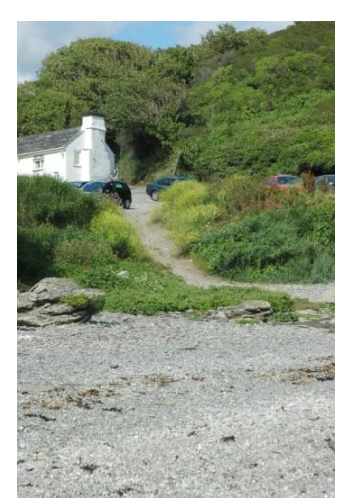
Access to Rotterdam Beach

There is safety/rescue equipment but no lifeguards.