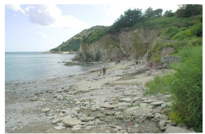
Talland Beach looking towards Downend Point

The sheltered nature of the Bay makes it ideal for snorkelling. The Bay offers some very interesting underwater scenery and is well known for its prawns. There are numerous rock pools at low water with easy access to those between the two main beaches.