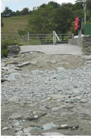
The slipway to Talland Sand

It is a great place for swimming as it is sheltered and generally safe in summer under normal conditions although it is better on a rising high tide: