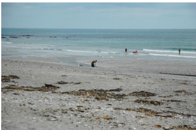
At low water with a shingle/sandbank

Either side of the beach, the flat rocky areas exposed at low water offer numerous rock pools that can be explored. It is a good beach for fishing or from the rocks on either side; Garfish, conger, mackerel, wrasse and Pollack can be caught.