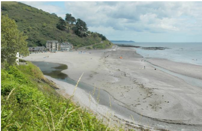
The beach at low water looking east

The beautiful Hessenford wooded valley meets the sea at Seaton where the Seaton River crosses a medium sized beach that is very accessible. Seaton in Cornish is 'Sethyn'. When the tide is out it is possible to walk along the foreshore past Keveral , Bodigga , Millendreath , and Plaidy Beaches to Looe west of Seaton, and to Downderry to the east. The beach is owned and managed by Cornwall Council.