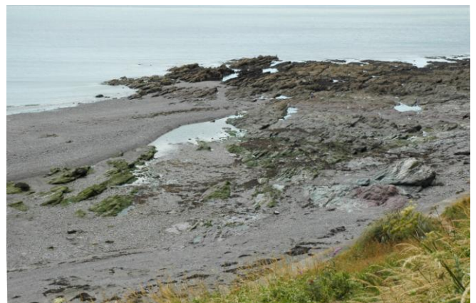
Shingle and rocky areas on the western side of the beach

It is a fairly safe beach for swimming but it is advisable to enter the water on a rising tide. Like so many beaches along this stretch of coastline there can be currents that are unpredictable at low water. Swimming at high water in quiet conditions can be a memorable experience.