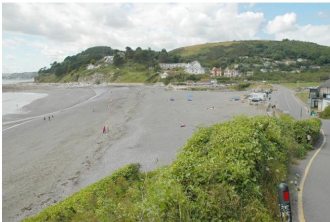
The main area of beach looking west

It is not a surfing beach at all but when there is a swell along the Channel there can be conditions suitable for body-boarding. When there is an offshore wind care should be taken with the use of inflatables.