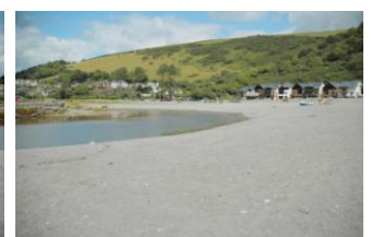
The river above high water