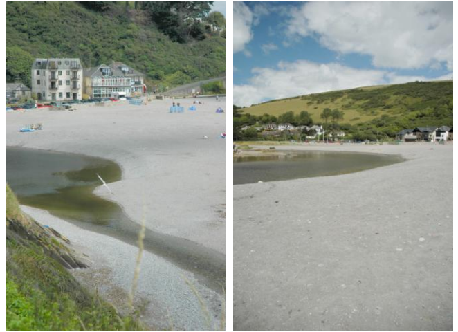
Views of the river crossing the beach

The beach which consists of coarse grey sand mixed with patches of shingle has a fairly extensive area of sand above high water (300m in length) which is undoubtedly one of the reasons for its popularity, especially with families with young children.