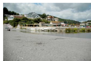
Facilities next to the beach

With a children's play area located just above the beach, it is definitely a beach for families even if the sand is a little stony. At low water it is a good beach for exploring along the foreshore.