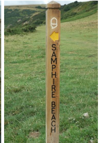
Sign from the Coast Path

A good area of coarse grey sand mixed with shingle is exposed when the tide recedes. From the access point it is worth wandering along the beach as there are further patches of sand which are secluded and very sheltered.