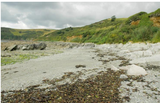
Sand, shingle and rocks

PL13 2DJ - From the A387 at West Looe next to the bridge over the river, take the road to Hannafore and continue along Marine Drive as far as possible (3½kms) where it abruptly stops at the end of the residential development. There is ample roadside parking above Wallace Beach . At the end of the road there is the Coast Path; the beach is 400m across a field, where just beyond is a sign to the access point on to the beach.