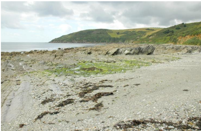
At low tide looking west across Portnaldar Bay

A small mostly rocky beach that is closer to West Looe than it may appear but is always quiet and secluded. At the western end of Portnaldar Bay it is possible to walk to Old Mills Cove (450m) and Hendersick Beach (600m) along the foreshore when the tide is out, or else along the Coast Path. To get to Samphire Beach from Looe you pass Wallace Beach (500m) and Hannafore Beach (1km).