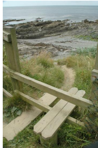
Stile to the beach

At high water it is mostly rocks and boulders