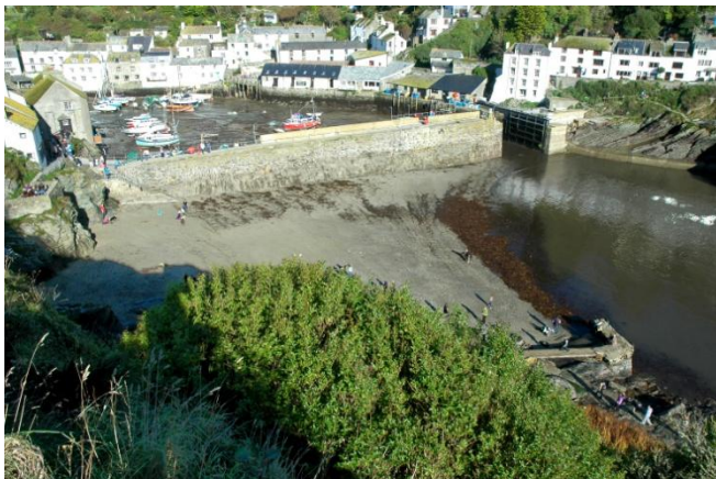
The Harbour and beach from Peak Rock

This picturesque small fishing harbour is a magnet for tourists because of its narrow streets, enchanting former fisherman's cottages which are all packed into a steeply sided valley. It is often described as the prettiest village in Cornwall. Whilst the harbour, boat trips and the quaint collection of shops, cafes, pubs and restaurants are the elements that most people remember, it does have a small beach outside of the harbour which at low tide is usually very crowded in summer. In Cornish Polperro is known as 'Porthpyra'.