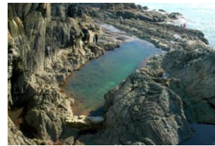
Bathing Pool in the rocks