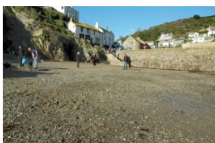
Sand and shingle beach

PL13 2RJ - From Looe it is 8kms along the A387 to the main car park (very large - capacity over 500 cars) which is at Crumplehorn some 750m up the valley from the Harbour. If approaching from the west it is also necessary to use this car park. There are roads into Polperro from Lansallos and Talland Bay down very narrow roads that lead into the village but it is not advisable to use them as there is virtually no parking in the village at all for visitors. It is a gentle walk down 'The Coombe' to the centre of the village but in summer there is a 'horse bus', electric trolley and minibus that can be taken if required. The beach can be reached by walking along Quay Road on the south side of the Harbour where there are steps down to the beach next to the pier. There is a rocky foreshore with a natural bathing pool along the Coast