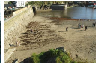
Beach next to the pier

Path the other side of Peak Rock which is easily accessible down a path and steps.