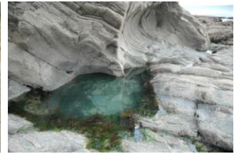
Interesting rocks and pools

an area of Plaidy Beach about 250m from the main beach; by continuing along the Coast Path the main slipway access is reached along Plaidy Lane.