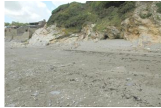
A small area above High Water