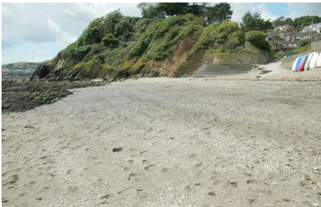
The main area of beach below the slipway access point

Plaidy is essentially a residential suburb of Looe and the beach is next to Millendreath (350m) and East Looe Beach (950m): it is easily possible to walk along the foreshore to Plaidy Beach from both at low water. Although the main area of beach between Raven Rock and Chough Rock is about 400m in length, it does continue for another 600m to meet with East Looe Beach. The main area of beach is backed by residential properties immediately above the beach. It faces south and can be quite sheltered.