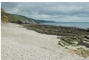
Looking east at low water

PL13 1LF - The easiest way to get to Plaidy without going through the centre of Looe (which can be difficult at times) is to take the A 387 road to Liskeard out of Looe and turn off on the B3247 to the suburb of St.Martins and after 2.5kms then sharp left down Barbican Hill which becomes Bay View Road and then Plaidy Lane when, after 300m on the right, is the slipway access to the Beach. Parking can be a problem as there are no dedicated parking areas so it is a case of parking along the estate roads where this is possible and walking back to the slipway. Care needs to be taken not to obstruct access drives and the residential roads. Alternatively, it is a short walk of about 500m along the Coast Path from the car park at Millendreath or a little over 1km from the Centre of Looe along the Coast Path there is a path down to an