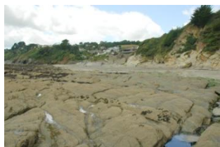
Rock formations at low water