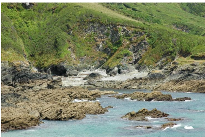
Palace Cove with the path to the beach on the right

PL23 1NP - 3kms on the coast road east of Polruan and 2.5kms west of Lansallos is a small National Trust car parking area next to Frogmore Farm (capacity about 40 cars) which is the nearest to both beaches. On the coast road opposite the car park there is a footpath that crosses two fields before joining the Coast Path (700m). At the confluence take the Coast Path eastwards for 500m and there is a small path down to Palace Cove. Similarly, by taking the Coast Path westwards for 150m, a narrow path doubles back to Lantivet Beach. However, it is possible to park in Lansallos and walk westwards along the Coast Path from Lansallos Cove to Palace