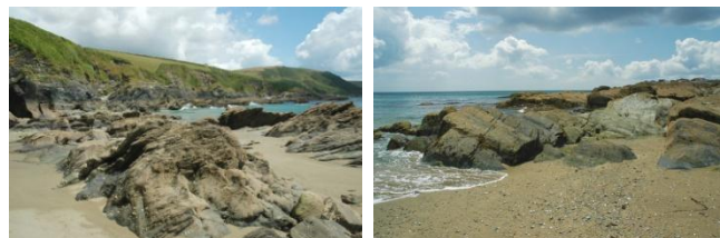
Looking towards Palace Cove