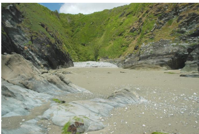
Lantivet Beach at low water

These are two small secluded south facing coves at the centre of Lantivet Bay are about 300m apart amidst striking cliff-land scenery. They are close to Lansallos Cove but parking and access is different.