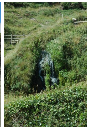
'Reed Water' – waterfall above Lansallos Beach