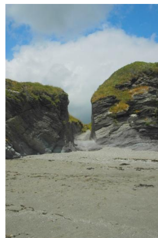
Path on to Lansallos Beach through a gap in the rocks

Lansallos Cove is certainly appealing and attracts larger numbers of people than the longish walk to the beach and lack of facilities would suggest; however, it does not get crowded except occasionally at high tide when the beach area is small. The smaller Parson's Cove does not have quite the same appeal and is often empty. It is possible to walk to Palace Cove from Lansallos Cove along the Coast Path a distance of 400m. Polperro Heritage Museum is worth a visit if details of smuggling and shipwrecks of the area are of interest.