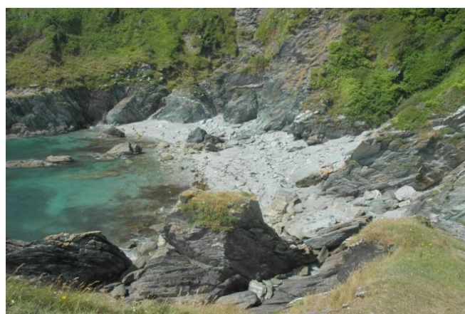
Parson's Cove at half tide

Lansallos Cove has a strip of mostly white sand and shingle above high water but at low water, a gently sloping beach of sand and white shingle (mostly derived from quartz) is formed into magical crescent shape. The beach is backed by cliffs of interesting heavily folded rocks. At low water the sand and shingle gives way to a rocky bottom under water. There is an area of boulders and stones on the westerly side of the beach at low water. A stream crosses the beach and there is a waterfall known locally as Reed Water above the beach. Parson's Cove has little or no beach at high water and is a mixture of sand, shingle and rock with rocky outcrops reaching out to sea. It is very sheltered and secluded with a more westerly aspect than the main cove.