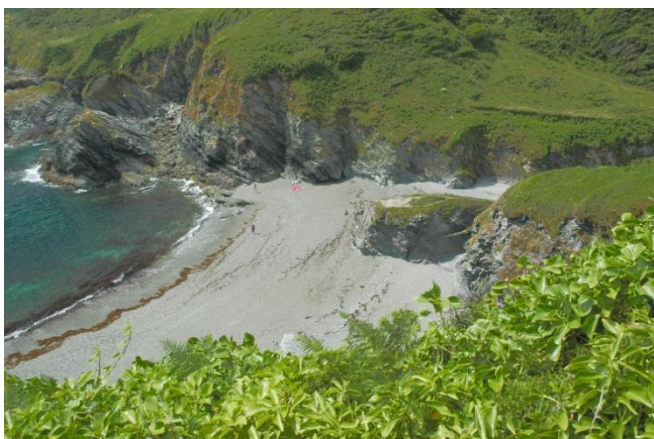
Lansallos Cove from the Coast Path

These are two accessible coves are part of Lantivet Bay. Lansallos Cove is the most well known and is often referred to as West Coombe Beach after the valley you walk down to get to it from the village of Lansallos, (or Lannsalwys in Cornish). It is a beautiful semi-circular cove that has a secluded southerly aspect. Parson's Cove (owned by the National Trust) is a short walk eastwards from the main Cove along the Coast Path and is much smaller.