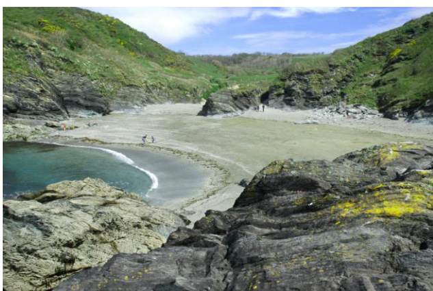
Lansallos Cove at low tide

PL13 2PX - Lansallos is 3.5kms west of Polperro , and is signposted either along Langreek Road or Raphael Road, both of which are fairly narrow. Coming from the west it is 4.8kms from the Bodinnick Ferry at Fowey with Lansallos being signposted at Whitecross. The National Trust car park (capacity 55+cars) is about 220m on the road above the Church. There is little roadside parking due to parking restrictions.