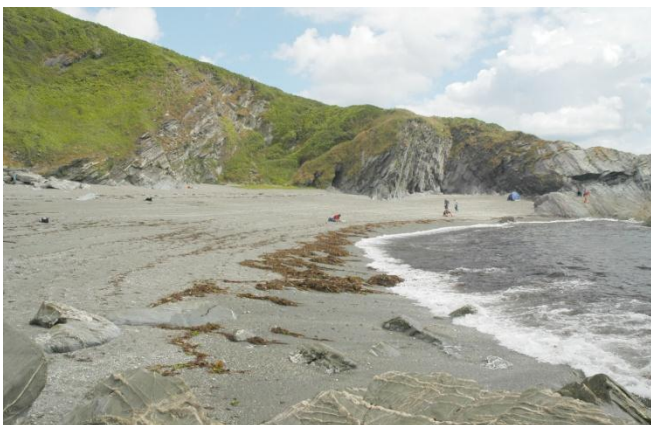
Interesting rock formations in the cliffs

At low water there are a few rock pools at Lansallos Cove, mostly on the westerly side of the beach. There are virtually no pools at Parson's Cove. Fishing is regularly undertaken off the beach and the rocks on the eastern side of the beach although in some conditions care needs to be taken. Mackerel, Wrasse, Pollack and Sea Bass would seem to be the most common species that are caught.