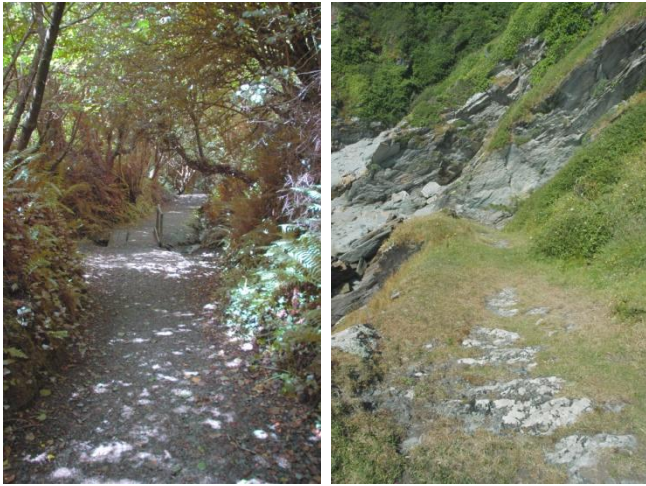
Path from Lansallos village