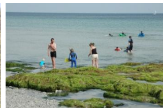
Rocks at low tide

It is largely sandy at high water but the gently shelving beach gives way to sand and fine shingle: at low water flat rock outcrops (covered in weed) predominate. There are rocky areas at either end of the beach.