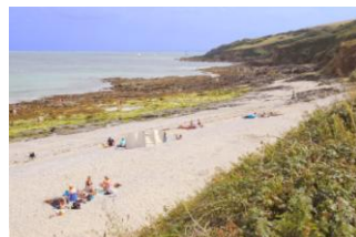
Towards Killigerran Head