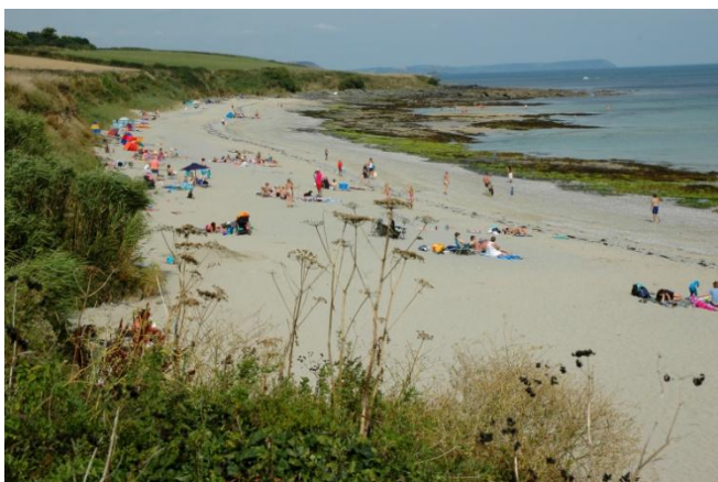
At low water in summer looking east

A sweeping south easterly facing, sandy and fine shingle beach which, unusually along this stretch of coastline, is backed by low friable cliffs and a small strip of sand dunes. It is owned by the National Trust.