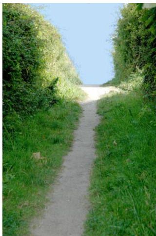
Path to the beach