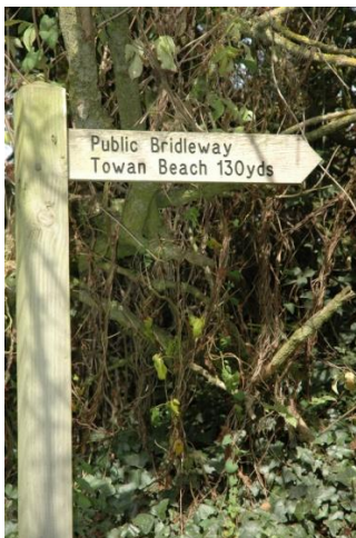
Sign to the beach

The beach is over 500m long even at high water which makes it larger than often expected.