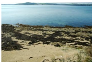
St. Just Pool and Carrick Roads