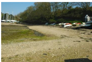
A sand and shingle beach

TR2 5JD – On the A3078 road from St.Mawes to Truro, 3kms north of St.Mawes is the village of St. Just-in-Roseland. At the junction with the B3289 to King Harry Ferry there is a road signposted to St. Just Churchtown; after 250m is a small car park (capacity 20+cars) on the right. It may be possible to park at the end of the road (a further 450m) above the beach at a few roadside parking spaces. An alternative parking area is back up to the main road and opposite the turning down to Churchtown is a car park (capacity about 35 cars) but involves a 800m walk down the road to the beach which is locally known as ‘The Bar’. To get to St. Just Pool involves taking the public footpath at the end of the private section of road; there is an access down to the foreshore in the corner of the first field or a better one 200m further along the field.