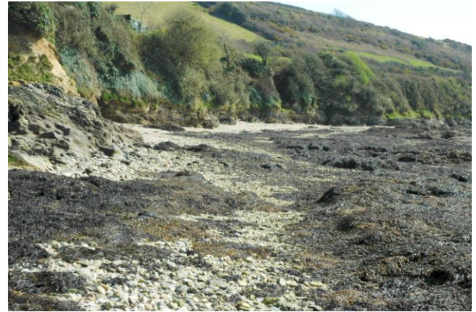
St. Just Pool Beach at low water