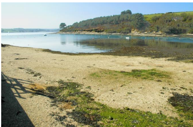
The St. Just Bar at low water in spring without the creek moorings

North of St.Mawes is the delightful hamlet of St. Just Churchtown with its sheltered creek beach that is easily accessible. Also, along the public footpath from St. Just Churchtown to St.Mawes alongside St. Just Pool there is 1km of foreshore leading to Tregear Beach that has a number of sand and shingle beaches that lookout over Carrick Roads and the Fal Estuary.