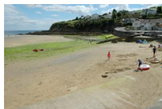
Looking south from the slipway

The slipway is good for launching small craft although it tends to be crowded in summer when the tide is high. Water quality is excellent. Portmellon is a good beach for water based activities and if beach facilities are not required.