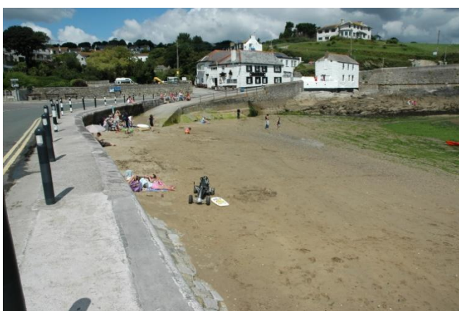
Portmellon Beach at low water

Very close to the picturesque fishing village of Mevagissey , Portmellon is an underrated small sandy cove despite being somewhat overlooked by modern residential and holiday development. It faces east and can be very sheltered from the prevailing winds. It never gets too crowded as it is tidal and the nearest car parks are some distance away. Polkirt is adjacent.