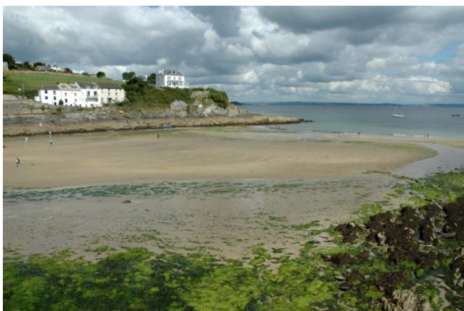
A flat sandy beach at low water

PL26 6PL - From the A390 in St. Austell, take the B3273 to the centre of Mevagissey (9kms), then turn right and up Polkirt Hill and after 1km there is Portmellon. The road runs right next to the beach and then on to Gorran Haven about 3kms to the south. There is only limited roadside parking and then care needs to be taken with restrictions in spring and summer. The nearest car parking is 1.5kms at Mevagissey. The walk to the beach depends on parking distance but there is a slipway giving an easy access on to the beach.