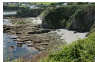
Polkirt beach at low water