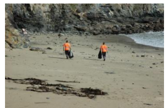
Cleaning the beach