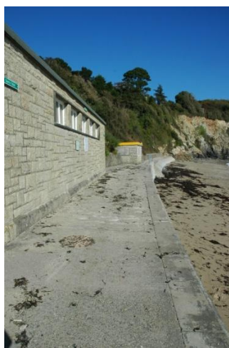
Toilets and cafe above the beach