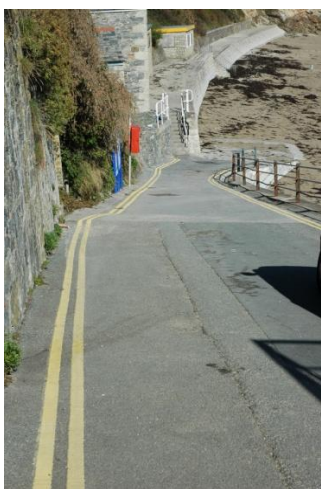
The slipway on to the beach

PL26 6AX - It is signposted from the A390 in St.Austell, a distance of 2kms. The car park (150+ cars) is less than 120m from the beach, with a large overflow field open at peak times. Access on to the beach is along a short stretch of road and down the slipway, making it suitable for the less mobile.