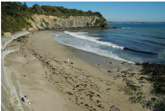
At half tide looking northwards from the slipway access

A fine, sandy easterly facing beach that is renowned for water-sports and popular with locals from the St.Austell area. Its name means ‘Little Cove’ in Cornish although it is not as small as the term implies. Carnjewey is a small, mostly shingle, beach to the south, which is cut off from Porthpean at high water.