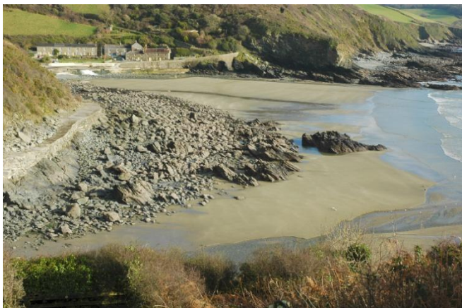
East Portholland and West Portholland with Perbean beyond

Two valleys reach the coast within 300m of each other and form a fine sandy beach at low water with East Portholland on one side with its collection of cottages and the smaller West Portholland on the other. Both settlements and are part of the Caerhays Estate.