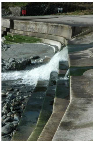
Stream cascading on to the beach