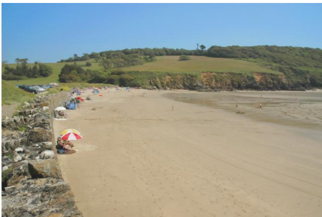
In summer looking east

A surprisingly large gloriously sandy beach formed from an unusually wide inlet along this stretch of coast and set against the backdrop of Caerhays Castle, designed by the Georgian architect John Nash. The Beach is part of the Caerhays Estate with its woodlands and parkland landscape making a wonderful setting.