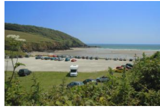
View of the car park and beach

The fine stretch of sand both at high and low water makes it popular with families. It is over 180m long at high water and involves a walk of over 280m to the sea at low water. It can be relatively sheltered with rocky areas either side of the beach as the tide