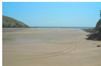
Expanse of sand at low water