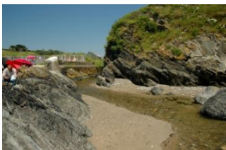
Stream crossing the beach

PL26 6LY - From the A390 St.Austell to Truro road, either take the A3078 to Tregony and then from the northern end of the village take the road signposted to Caerhays (a distance of some 7kms), or, the B3287 from Hewas Water (near St.Austell) and after 3kms turn left and follow the signs to Caerhays, (about 6kms). There is a large car park (capacity over 280 cars) right next to the beach. Access on to the beach is straightforward and good for the less mobile.