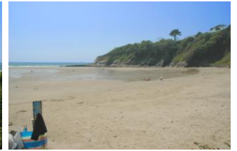
Looking to Watchhouse Point

goes out. There is a grassy area above the beach.