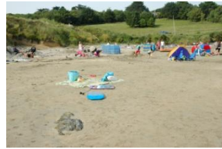
Area below the toilets and cafe