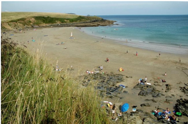
At low water in summer looking towards Pednavadan

A sandy and sheltered south facing family beach that is popular in the summer. Close to the harbour of Portscatho, it is owned by the National Trust.