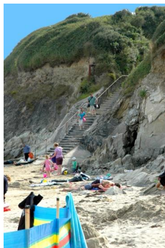
Steps from Portscatho car park