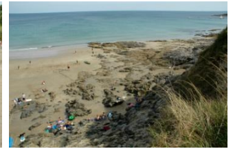
The southern part of the beach