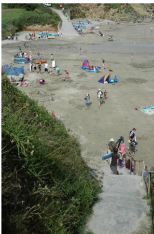
The steps to the beach and slipway the other side

TR2 5EW - From the A3078 to St. Mawes, at Trewithian follow the road signposted to Portscatho and Gerrans. After 1.5kms, turn left to Portscatho and again on the left is a car park (capacity about 85 cars). There are two footpaths that lead from the car park across fields to the Coast Path (100m) and then by going north for 200m there is a flight of steps to the beach. Alternatively, the beach can be approached by turning off the A3078 at Trewithian along the road signposted to Rosevine which ends up as a slipway to the beach a distance of 2.7kms; there is a limited amount of roadside parking which provides an easy access for the less mobile but care needs to be taken not to obstruct the road.