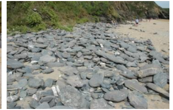
Stones above high water