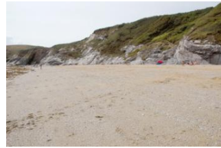
Looking west along the beach