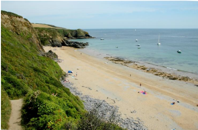
Low tide in summer looking towards Porthmellin Head

A deceptively large south facing beach at low water that is largely owned and managed by the National Trust: it is moderately sheltered and popular with the boating fraternity from the nearby Fal Estuary.