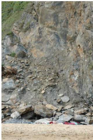
Recent cliff falls