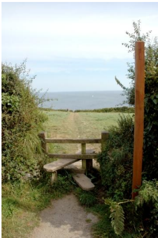
Path from the road

TR2 5EY - From the A3078 to St. Mawes, at Trewithian follow the road signposted to Portscatho and Gerrans and then continue for a little over 3kms on the road to St. Anthony Head, where there is a stretch of the road with space for somewhat limited roadside parking (about 20cars). Care needs to be taken not to obstruct gateways and the road. About 80m beyond the entrance to Bohortha Manor, on the south side of the road, there is a stile with signpost to the beach and footpath; it is not recommended for the less mobile as the path crosses a field (60m) and then descends down the cliff with steep steps near the bottom. Care needs to be taken when parking not to obstruct the road and field gates.