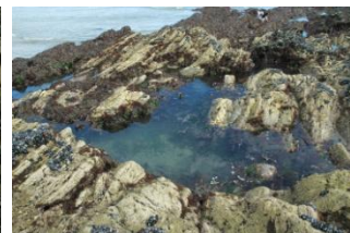
Wonderful rock pools