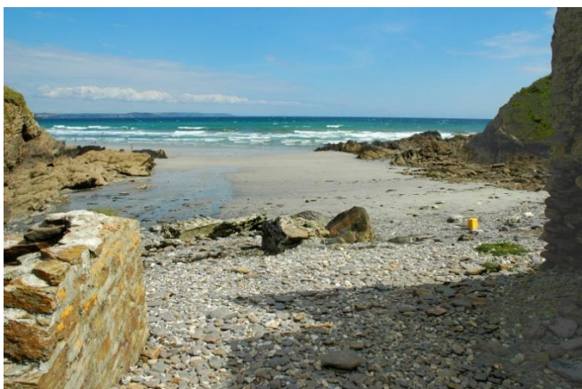
Portgiskey at low water

A small cove to the south of the Pentewan Sands and joins this much larger beach at low water. It also gives access to much of the southerly end of Pentewan Sands, also known as Sconhoe Beach, where there is no direct public access. It is a quiet and secluded easterly facing cove with the remains of former Pilchard Cellars above the beach. Access to the beach involves a walk along the Coast Path.