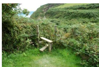
Stile and path to the beach