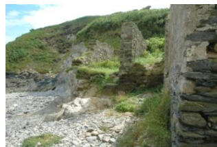
Remains of Pilchard Cellars