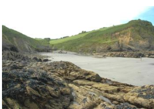
The Cove from the south

PL26 6BT - this postcode is for Pentewan Sands Holiday Park which is 500m north of Portgiskey. Take the B3273 south from St.Austell or north from Mevagissey to Pentewan village where there is a small car park (capacity 50 cars) or a limited amount of roadside parking. It is then a walk next to the former Harbour to get on to Pentewan Sands and then a walk along the beach (1.2kms) but this can only be done at low tide. If the tide is higher it means walking along the B3273 southwards past the Holiday Park and up the hill to where the Coast Path leaves the road (1.3kms). Portgiskey is at the bottom of the first valley where there is a stile and a path that leads down to the beach. Alternatively, there are a few roadside parking spaces on the B3273 just above where the Coast path leaves the road which makes the walk less than 250m.