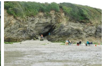
A secluded area by the cliffs

white sand above high water mark that stretches from the mouth of the Par River, next to Par Docks in the west to the low cliffs at Polmear (some 900m). The easterly side of the beach with the low cliffs and stream that crosses the beach is the most popular part of the beach and the most sheltered and secluded. At low water the tide recedes for over 800m, often to Killyvarder Rocks and beyond the breakwater which runs out to sea next to the Par River. The westerly parts of the beach can be muddy with the rest a fine silt often covered in seaweed.