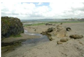
Stream on the easterly side

It is a very large beach with the strip of fine