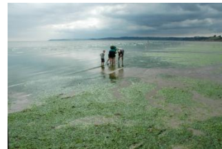
Exploring at low water