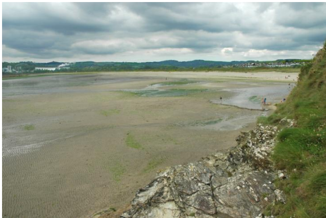
A flat expanse of sand and silt at low water backed by sand dunes

A south facing expanse of sand that could have been the jewel in the Cornish Riviera but as a result of centuries of mineral extraction above St.Austell is now a flat beach of fine silt with a backdrop of the adjacent Par Docks and China Clay Works. However, backed by a sand dune system it has some qualities including part of the dunes being a Local nature Reserve; it is Council owned and never gets overcrowded.