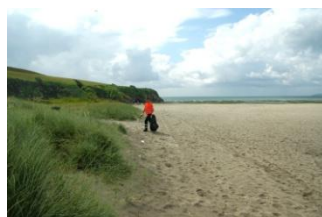
Litter picking by the sand dunes