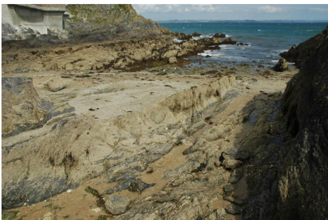
The shingle and stony Island Beach next to North Pier

PL26 6RZ - From St.Austell take the B3273 past Pentewan Sands which after 7.6kms ends up in Mevagissey. There are three major car parks (the largest with a capacity of over 340cars) which are easily accessible and signed when approaching the centre of the village with them all being on the left-hand side and less than a 300m walk down the road to the harbour. To get to the sandy beach next to West Pier turn right and there are steps down to the beach at the bottom of Polkirt Hill. The shingle and stone beach, sometimes known as Island Beach, can be reached by walking along East Wharf past the Museum and Harbour Office on to North Pier where there are steps down on to the beach.