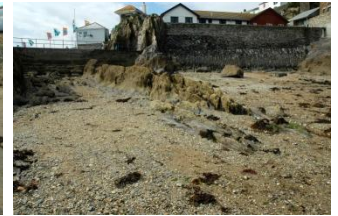
The Island Beach