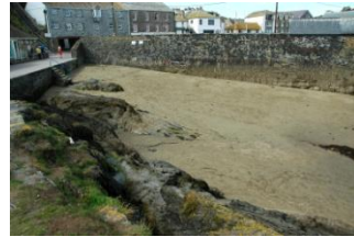
West Pier Beach