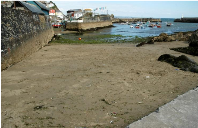
A sandy beach next to West Pier in the outer harbour at low water

Well known as a picturesque fishing harbour, the small beaches at Mevagissey are not really much of a draw to this popular and visitor destination. There is a sandy beach in the Outer Harbour and a shingle and stone beach on the other the far side of the Harbour.