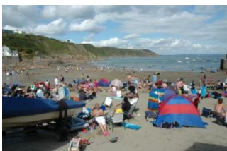
Gorrán Beach in summer

PL26 6JG - From St.Austell, Gorrán Haven is 13.5kms along the B3273 and just before reaching Mevagissey turn right and follow the signs; although the road does a large loop around Mevagissey it is simpler and quicker. On entering the village continue down the hill and the only car park (capacity over 380 cars) is on the left. There is little or no roadside parking in the summer months. Gorrán Beach is a 300m walk down the road to a slipway access on to the beach which is suitable for pushchairs and wheelchairs. To get to Little Perhaver Beach walk down the road from the car park and turn left up Church Road and after 90m there is a path on the right next to Zion Cottage which after 100m leads to steps down to the beach. Alternatively, at low tide access can be the short walk across Gorrán Beach.