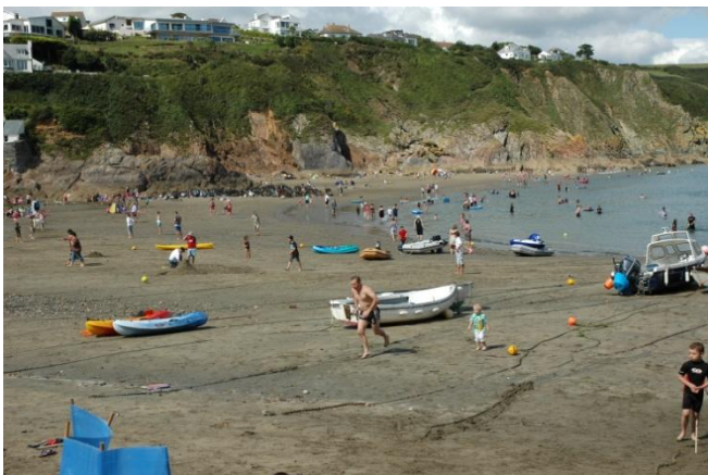
Gorrán Beach with Little Perhaver beyond

These are two easterly facing beaches, which are joined at low water, are next to the small fishing harbour and village of Gorrán Haven, or 'Porthyust' in Cornish. With former fishermen's houses nestling around the road access to the harbour, the beaches have a picturesque backdrop despite a sizeable amount of more modern development. The beaches are easily accessible and popular with families.