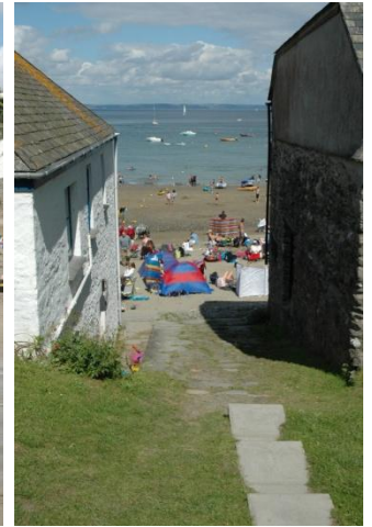
Views of Gorrán Beach