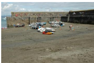
Gorrán Harbour at low water