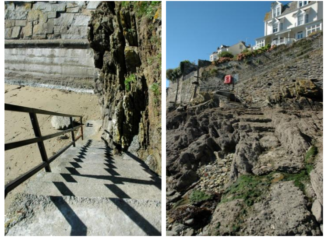
Access from Whitehouse Quay Access by the former Blockhouse