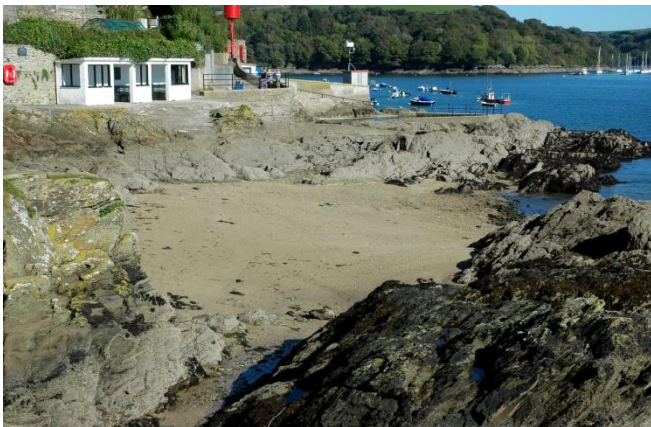
A small sandy beach below the Esplanade

A series of small sandy beaches below the Esplanade in the centre of Fowey largely go unnoticed by visitors as they are somewhat tucked away. They are very sheltered and face Polruan on the other side of the Fowey Estuary. To the south is Readymoney Cove around Point Neptune (500m) and to the north Fowey Harbour. At the southerly end of the beaches is the remains of a 14 th Century Blockhouse that once housed a chain that spanned the Estuary to Polruan to act as a sea defence.