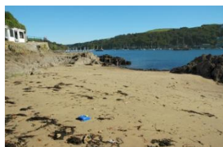
Beach below the Fowey Hotel