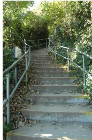
Steps down to the beach