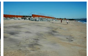
Fishing off Crinnis Beach