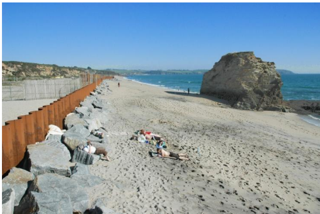
Crinnis Beach in late summer

Carlyon Bay was once one of the top beaches in Cornwall with over 1km of fine white sand but a series of poor Planning Decisions over many years has had a hugely detrimental effect on the place. Although it is