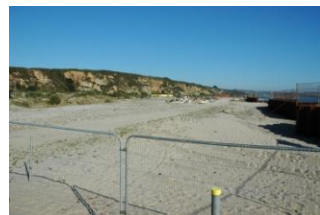
Shorthorn awaiting development

Dogs are not allowed all year. There are currently no facilities at all.