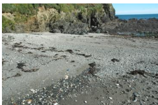
Grey sand and shingle

PL23 1HW - At the confluence of the A3082 and the B3269 at the Newtown roundabout on the outskirts of Fowey, take the B3145 and then immediately first right along a narrow road to Coombe. After 1.1kms there is a small National Trust car park (capacity about 30 cars) above Coombe Farm. At the entrance to the car park take the farm track down past the farm and after 200m there is a stile in the hedge on the right; this leads to a well marked permissive path which winds down the valley and after 380m joins up with the Coast Path immediately above the main beach where the access is straightforward. To get to Little Coombe Hawne involves a walk westwards along the Coast path for about 130m where there is a narrow path down to the beach. An alternative way to the beaches is to park above Readymoney Cove and walk (850m) along the Coast Path past St. Catherine's Castle.