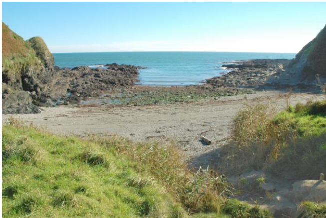
Coombe Hawne at low water

Two small south easterly facing coves between Readymoney Cove and Polridmouth . Coombe Hawne, like so many coves on the south coast, is associated with smuggling in the mid 19 th Century and is fairly accessible but involves a walk. Access on to the beach at Little Coombe Hawne is more difficult.