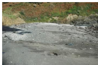
A gently sloping beach