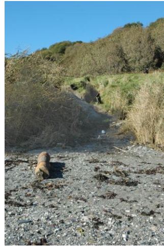
Access to Coombe Hawne