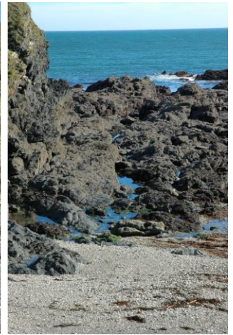
Rocky area at Coombe Hawne