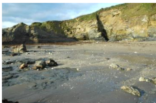
A largely sandy beach

There is little or no beach at high water but the gently sloping foreshore ends up as a mostly flat sandy beach at low water that has flat rocky ledges on its northerly side and can have patches of shingle and stone after winter storms. It is relatively exposed to