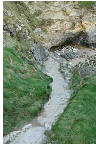
Path down to the beach