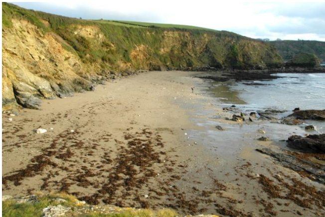
Booley Beach looking south at low water

A medium sized westerly facing beach that is often joined to Par Sands at low spring tides but is completely different in character. It is reached either from Par or Polkerris along the Coast Path and is quite accessible despite being backed by high cliffs.