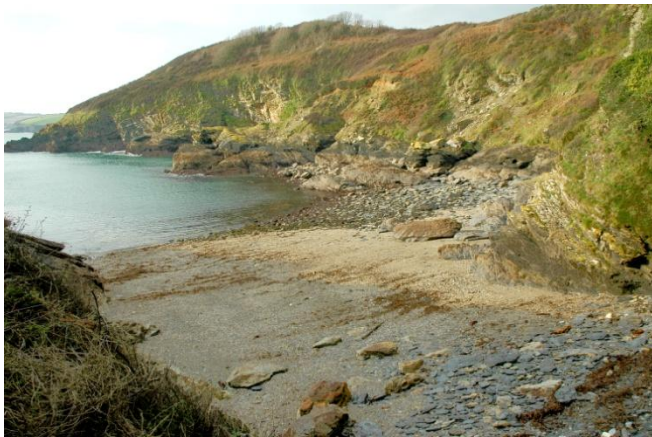
The Cove with Drennick headland beyond

A delightfully secluded small cove, (seemingly without a name), that nestles into the westerly side of Black Head and involves a walk from Trenarren with wonderful views along the coastline.