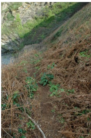
Narrow path to the beach

PL26 6BH - From the A390 at Mount Charles, St.Austell, follow the signs to Porthpean (but do not turn off) and continue along the narrow road with passing bays signposted to Trenarren (3.7kms) where there is small parking area next to the road (capacity about 20 cars). Then take the left-hand fork in the road which is a public bridleway (and farm track) and continue for about 850m and turn left at a junction with a public footpath which joins the Coast Path and at the Memorial stone to A.L. Rowse (the Cornish Historian); follow the path to the headland where there is a narrow path on the right which goes down to the Cove. The path above the beach is not for the feint hearted but quite safe if care is taken.