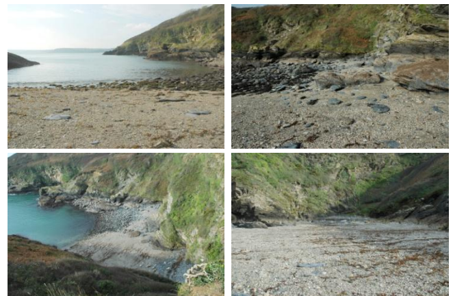
Views of the beach

Dogs are permitted but there are no facilities at all, the nearest being at Porthpean which is over 1.5kms from the parking area.