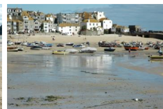
View from Western Pier