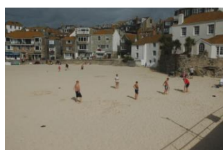
Dry sand above high water

a very windy day there is usually a part of the harbour that is sheltered and in mid-summer it can appear to be almost tropical. With the beach surrounded by harbour walls, the wonderful sand and all the harbour activity ensures it has a lot to offer.