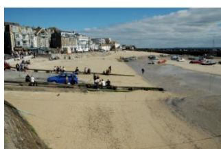
The 'Sloop' slipway mark

At high water there is only a thin strip of beach from the Sloop slipway, in front of The Wharf and on to Smeaton's Pier. However the fine golden sand is amongst the best in Cornwall. When the tide goes out, virtually the whole harbour is exposed with water retreating right to the end of Smeaton's Pier. Even on