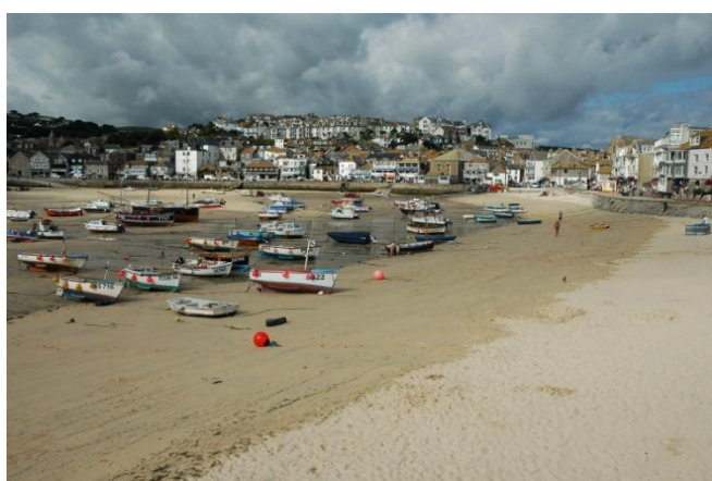
Harbour Beach at low water

A wonderful beach at the heart of picturesque St.Ives. Being part of a working Harbour where local fishermen still land their catches, it oozes character and charm but can be very busy in the height of summer. It is bounded by Western Pier on one side and Smeaton's Pier on the other.