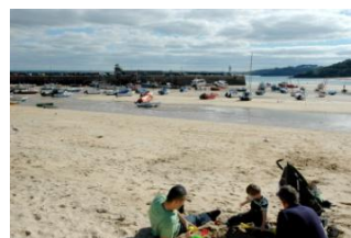
Looking towards Smeaton's Pier

a very windy day there is usually a part of the harbour that is sheltered and in mid-summer it can appear to be almost tropical. With the beach surrounded by harbour walls, the wonderful sand and all the harbour activity ensures it has a lot to offer.