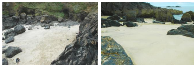
Stony beach at high water