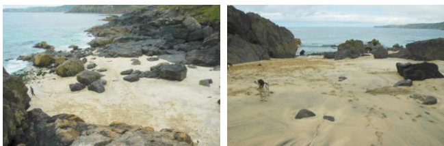
The access rocks in foreground Gently sloping sandy beach

TR19 7ED - From the B3306 at Pendeen, (4kms north-east of St.Just) follow the road to Pendeen Lighthouse (1.5kms) which is signposted; take the right fork by the Lighthouse for 100m to a parking area (about 30+ cars). Walk back along the track to the Lighthouse and follow the path that runs northwards by the side of the wall (or along the curved road that leads to the Lighthouse entrance) where there is a gate and steps giving access to Pendeen New Cliff. Follow the worn grass path due northwards which leads to rock platforms with the cove on the right – go down the rocks immediately