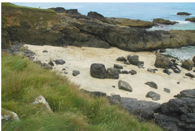
The Cove at low water

This small north facing cove immediately below Pendeen Lighthouse does not appear to have a documented name, even on historical maps, but is known locally as Sandy Cove. For much of the year it lives up to its name although after periods of winter gales the sand can diminish and it can be quite stony.