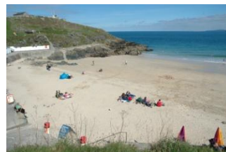
Low water in summer