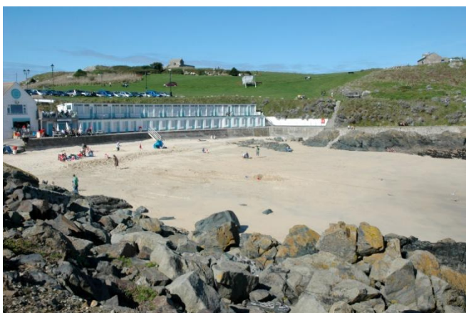
The beach with 'the Island' behind

A hidden treasure of a beach which is only 250m from the harbour but has the old heart of St. Ives called 'downalong' with its narrow streets and delightful cottages in between. It is shielded from the northerly winds by 'the Island' headland with its distinctive former chapel on the summit. It faces east with marvellous views across the Bay. Its name means 'White Cove' in Cornish.