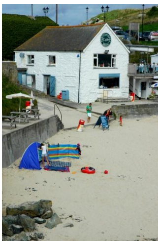
The beach and cafe

TR26 1PL - For access and parking details refer to the overview for St. Ives . From 'The Sloop' by the Harbour in the centre of Town, it is a short walk up Fish Street and Island Road; the beach is behind the Island car park. The main access is down a ramp although there steps from the Island on one side and Bamaluz Point on the other. Porthmeor Beach is the other side of the Island car park close by with