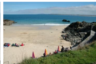
View across the bay

Bamaluz Beach around the Point on the other side.