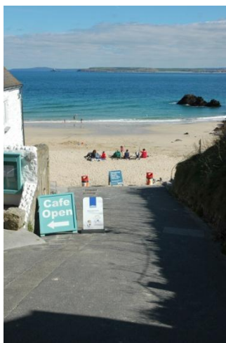
Ramp down to the beach