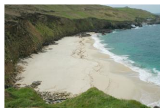
Towards Pendeen Watch

The beach profile often results in a heavy surf. It is exposed to the Atlantic swell but the wind is often cross-shore leading to a quality shorebreak, especially at high water. Conditions are generally unsuitable for diving and snorkelling and there are only a few rock pools at the western end of the beach.