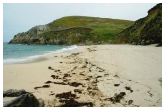
Strip of sand above high water