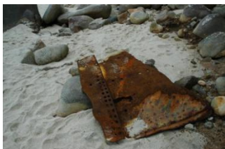
Remains of the 'Alacrity'