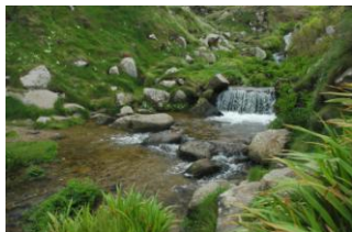
Path across the stream