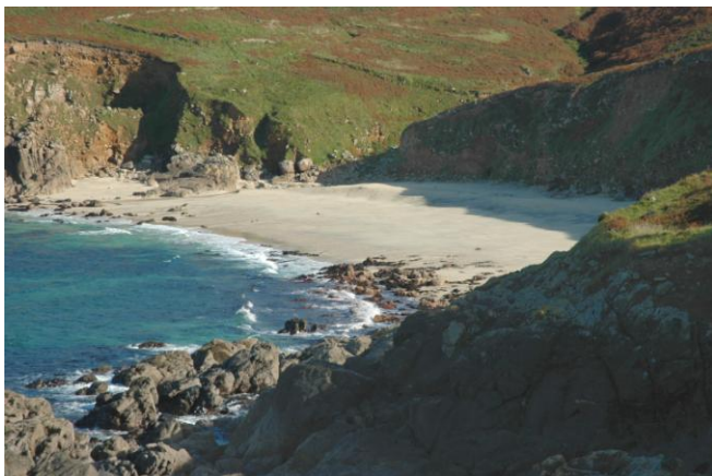
At low water with long autumnal shadows cast over the beach

Set in a wild, rugged and windswept stretch of 'granitic' coastline, this sandy, northerly facing beach is a real find. Located at the confluence of two valleys it is dominated by high cliffs; it is owned by the Duchy of Cornwall. It is a good spot to watch seals.