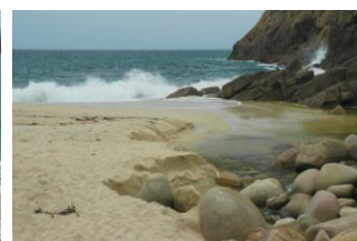
Rounded granite boulders