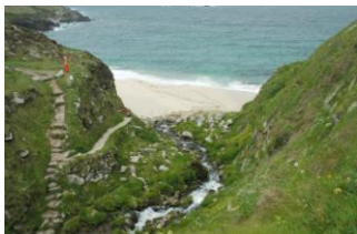
Path to the beach

TR19 7TU - The easiest way to get to Portheras is from the B3306, 500m west of Morvah, at Rose Valley, take the narrow road signposted Lower Chypraze. After 500m by the farm is a field for car parking (30+cars capacity). There is a delightful walk of 500m down the valley along the public footpath, which involves crossing the stream with access on to the beach not suitable for the less mobile. Alternatively, there is a car park next to Pendeen Lighthouse (30+cars capacity) and the beach is a walk, of 1km along the Coast Path in an easterly direction: again access on to the beach would not be easy for some.