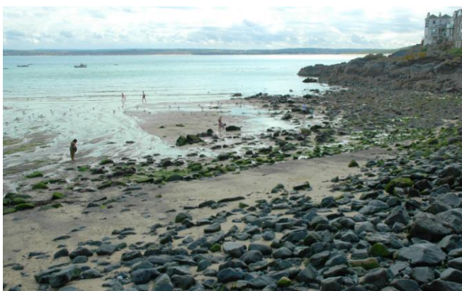
At low tide looking towards Pednolva Point from Westcott's Quay

A small beach that is arguably the least attractive of all the beaches in St.Ives but has stunning views across the Bay and the Harbour. It is a mixture of the famous St.Ives sand with dark dolerite stones