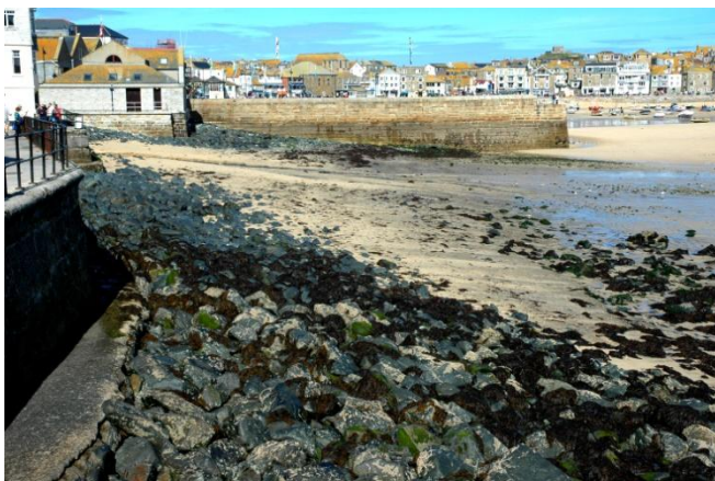
Lambeth Walk Beach looking towards Western Pier & the Harbour

Although joined to Harbour Beach at low water, it is regarded locally as having its own identity. It takes its name from the popular pedestrian route from the town to Porthminster Beach called Pednolva Walk, locally called Lambeth Walk, named after the popular dance tune. It has an easterly aspect.