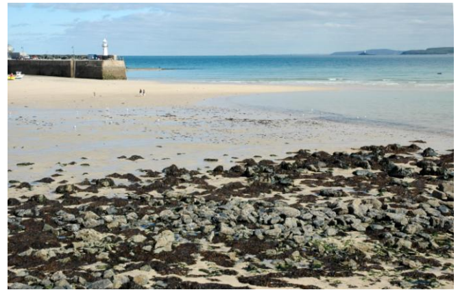
Views out across the Bay and the lighthouse on Smeaton's Pier

and boulders. There is little or no beach at high water but at low water it joins the Harbour and Porthminster Beach around Pednolva Point.